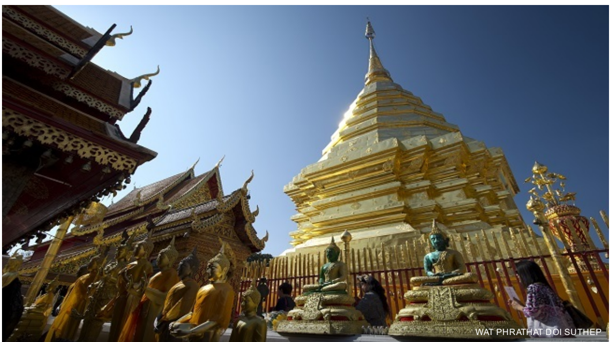
WAT PHRATHAT DOI SUTHEP