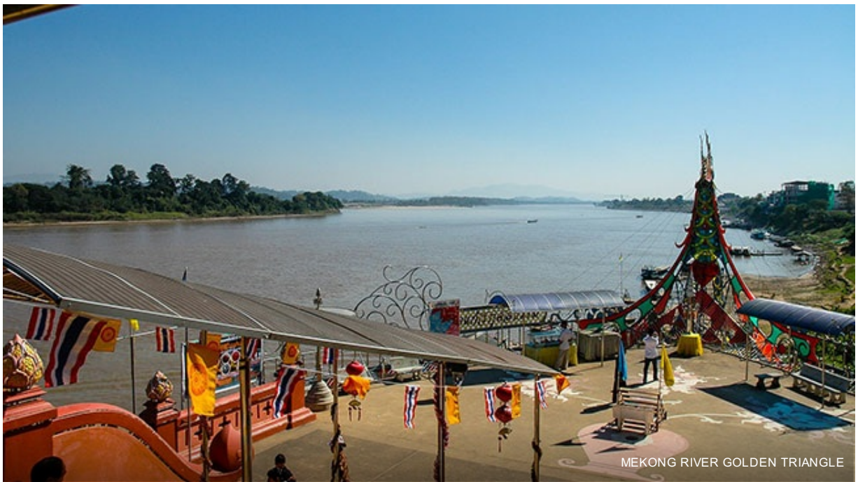
MEKONG RIVER GOLDEN TRIANGLE