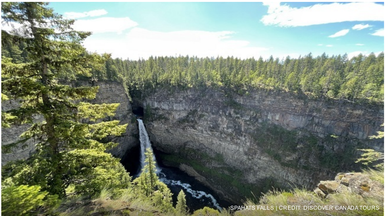
SPAHATS FALLS