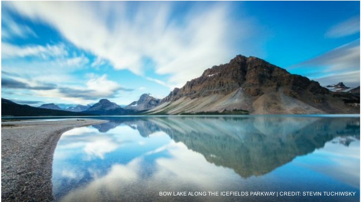
BOW LAKE ALONG THE ICEFIELDS PARKWAY