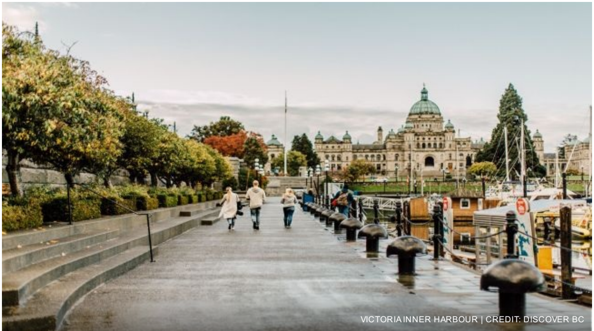
VICTORIA INNER HARBOUR