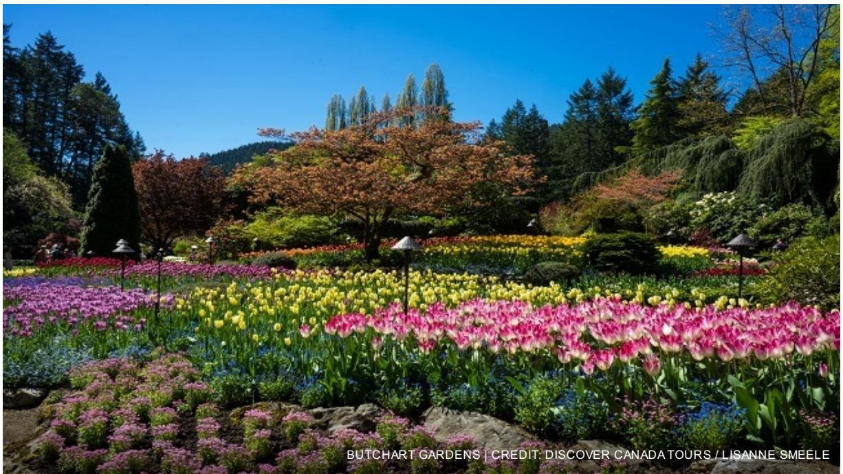
BUTCHART GARDENS | CREDIT: DISCOVER CANADA TOURS / LISANNE SMÉE LE