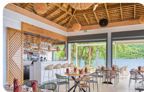
📍 Cook's Bay Resort & Suites