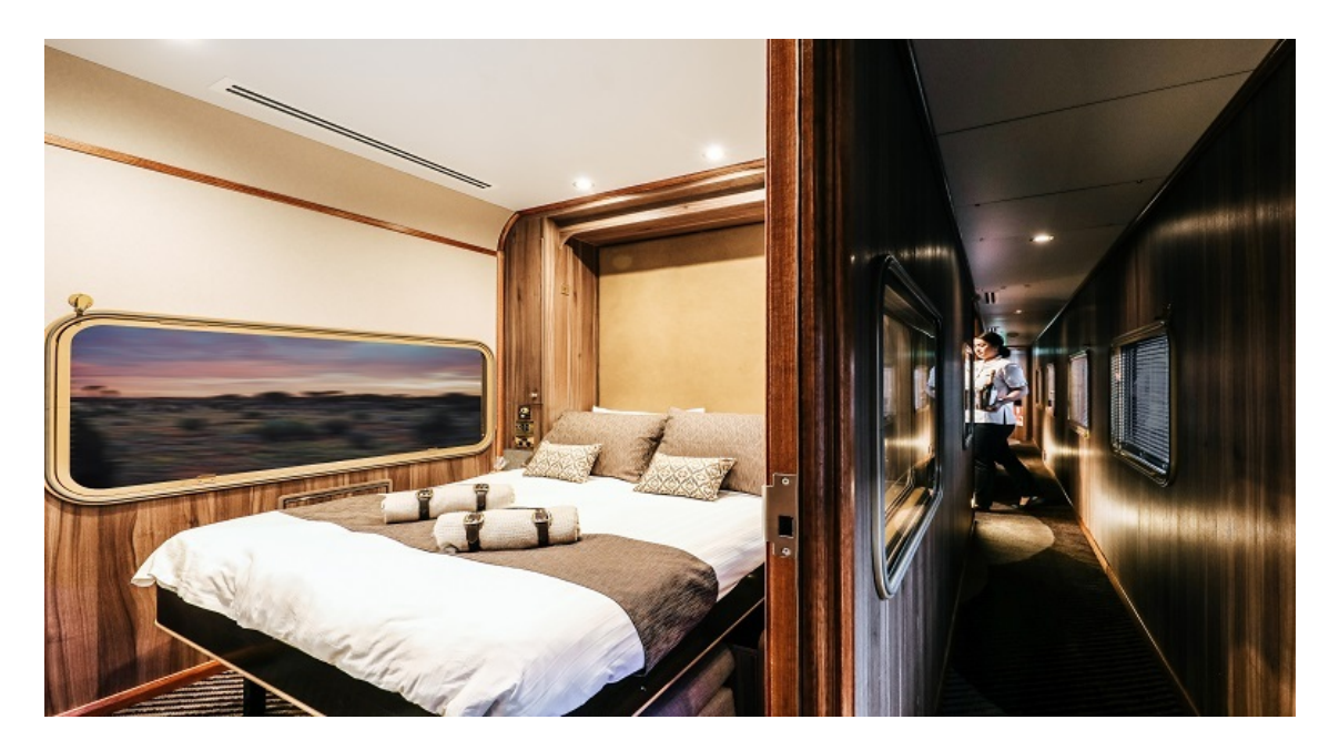
Prices are dynamic based on travel dates. Please proceed to Book Now or Contact Us for details.