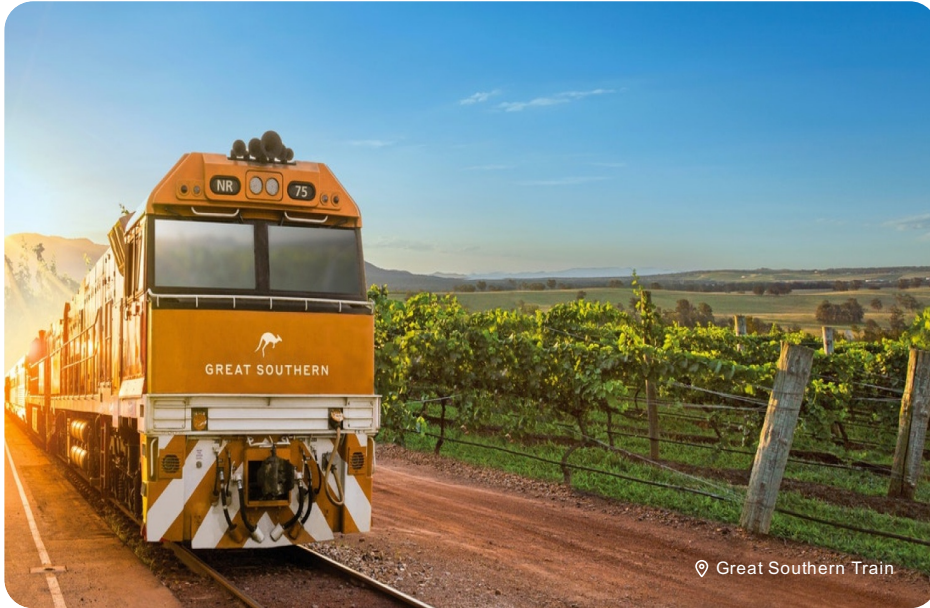
Great Southern Train