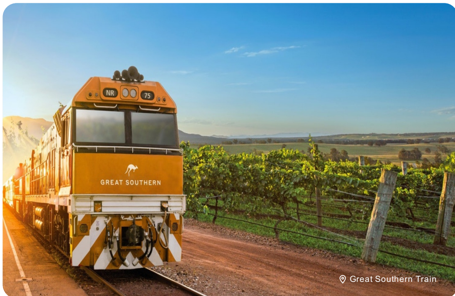
Great Southern Train