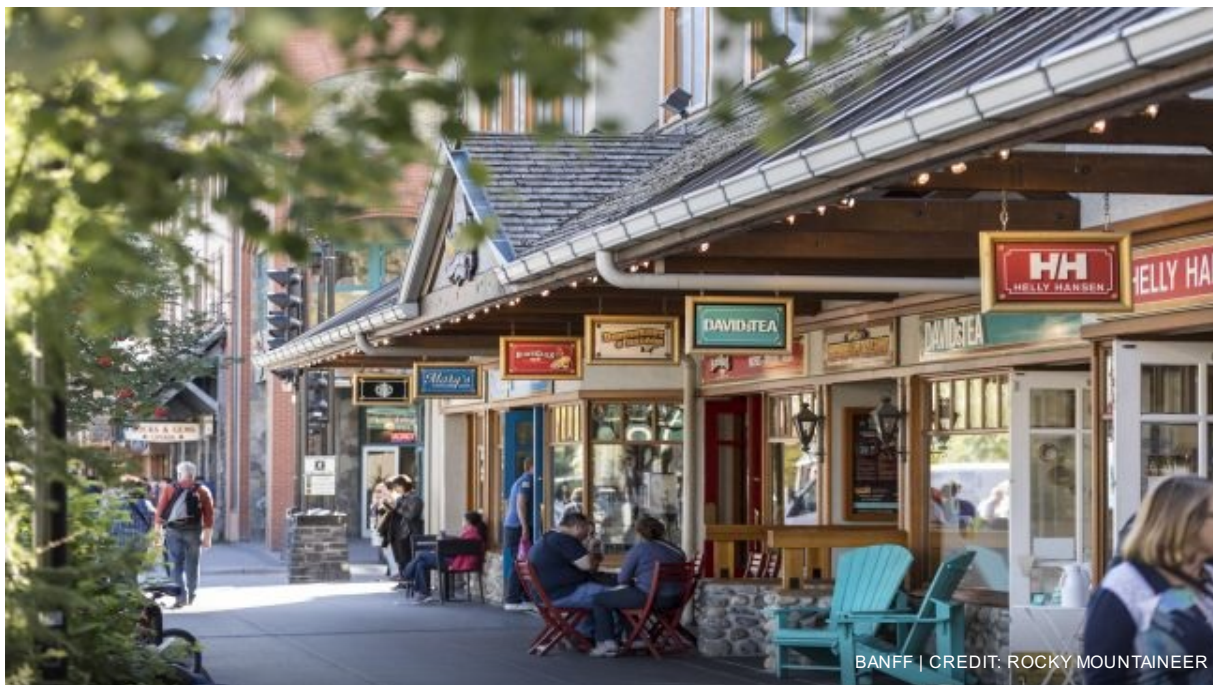
BANFF

Overnight in Banff at the Fairmont Banff Springs