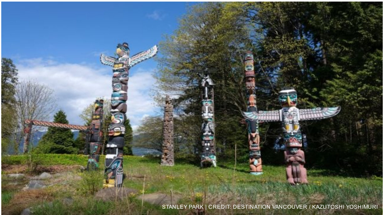
STANLEY PARK

Overnight in Vancouver at the Fairmont Hotel Vancouver