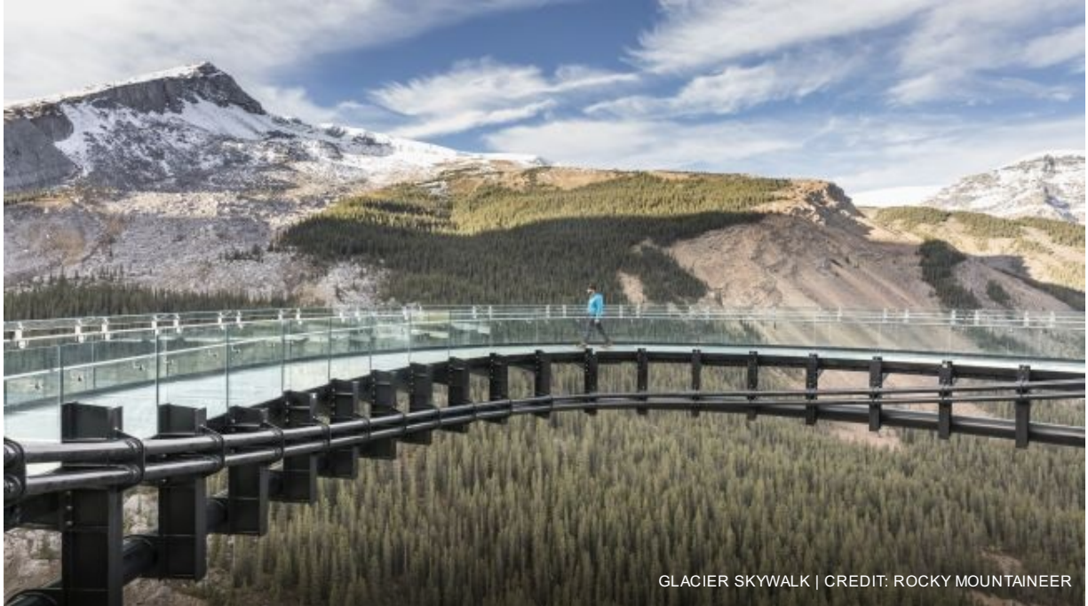
GLACIER SKYWALK