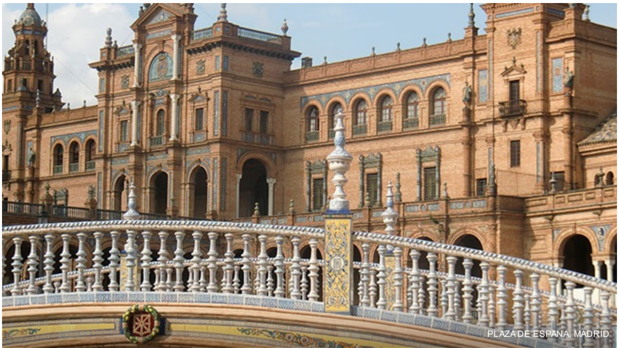
PLAZA DE ESPAÑA, MADRID