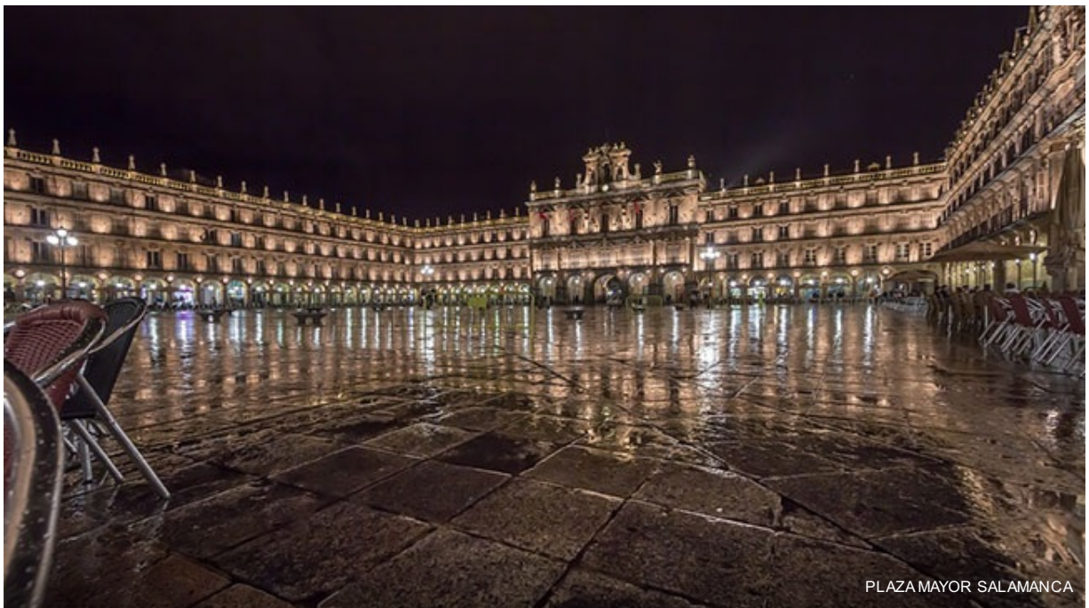
PLAZA MAYOR SALAMANCA