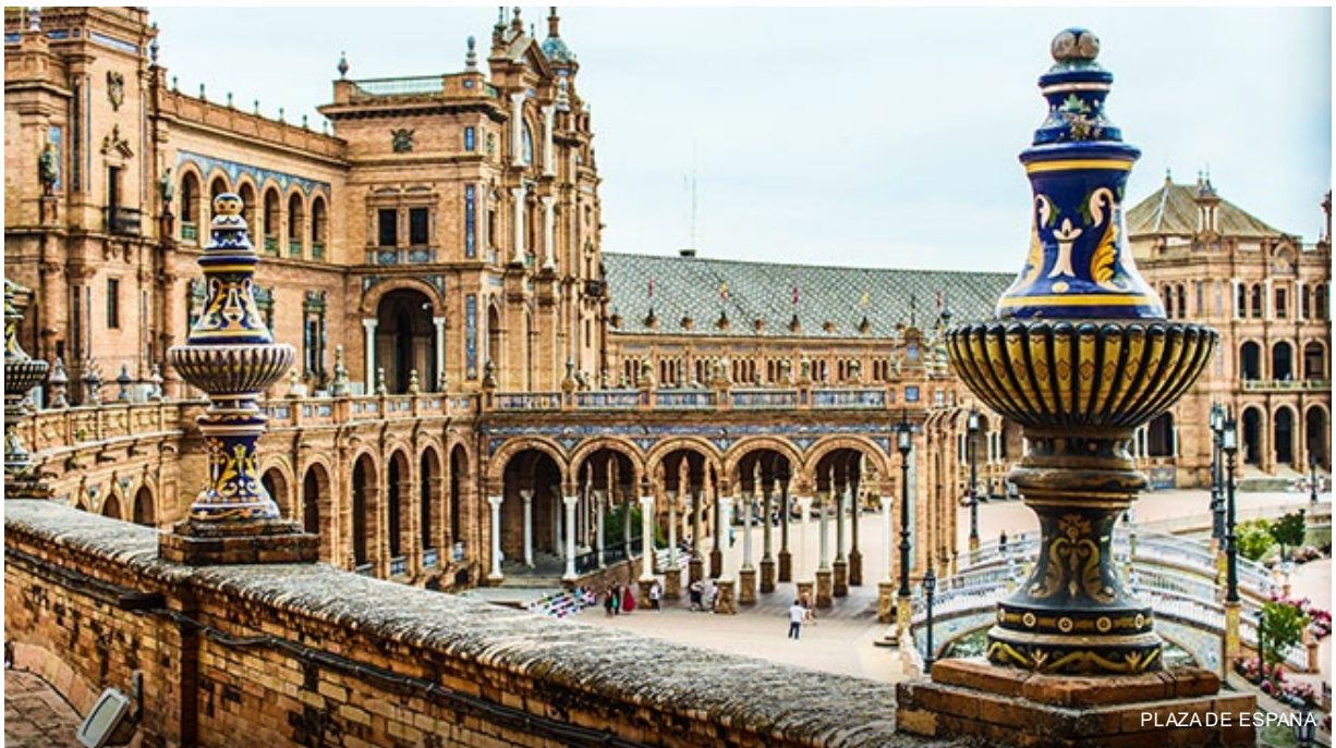
PLAZA DE ESPAÑA