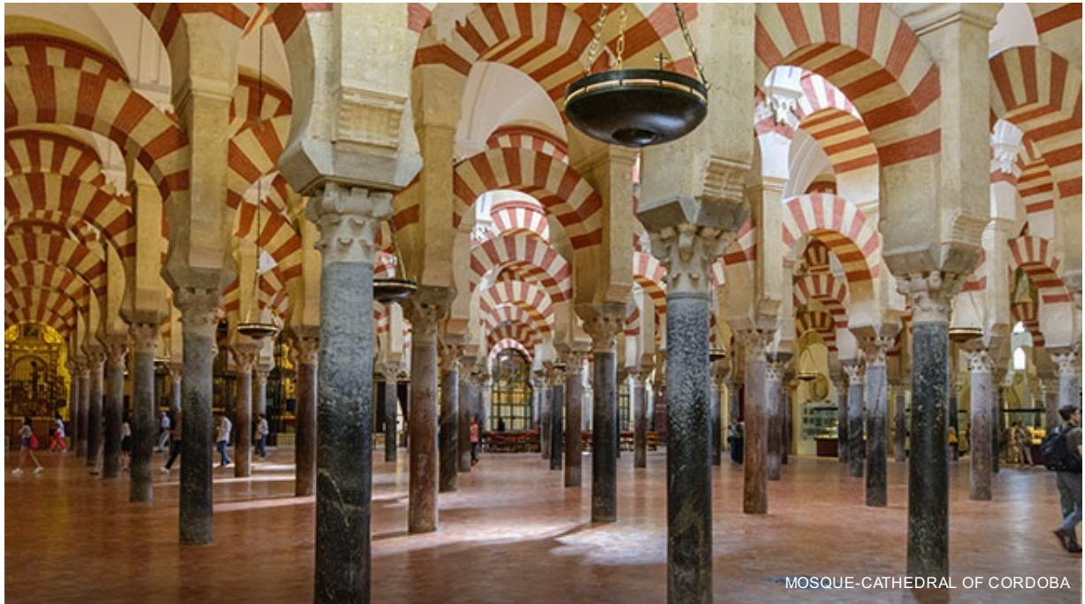
MOSQUE-CATHEDRAL OF CORDOBA