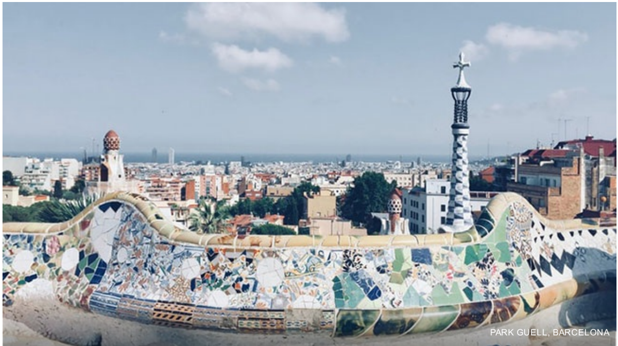
PARK GUÉLL, BARCELONA