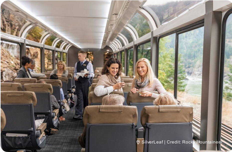
📍 SilverLeaf | Credit: Rocky Mountaineer