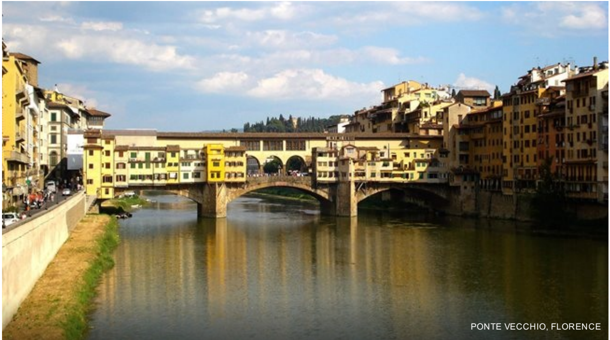
PONTE VECCHIO, FLORENCE