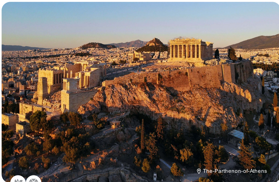
The Parthenon of Athens