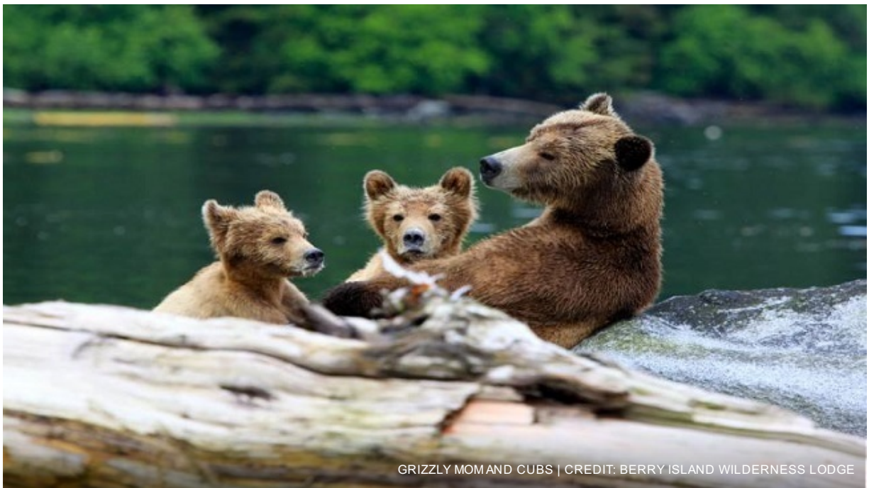
GRIZZLY MOM AND CUBS