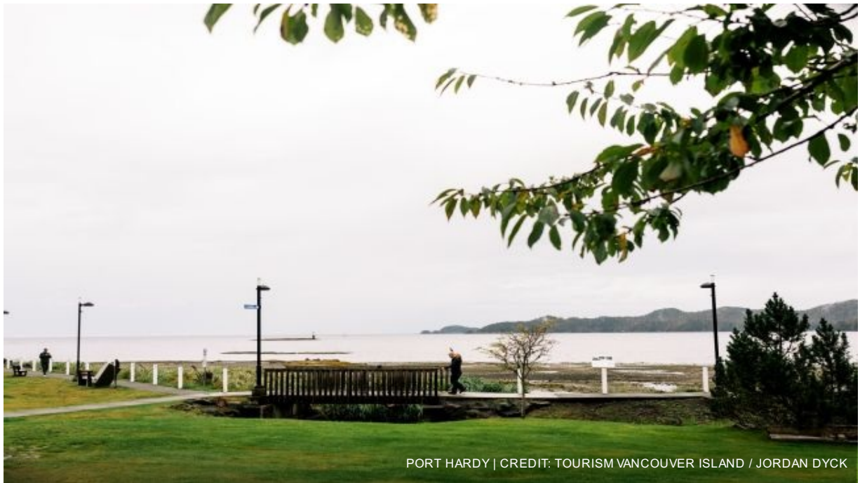
PORT HARDY