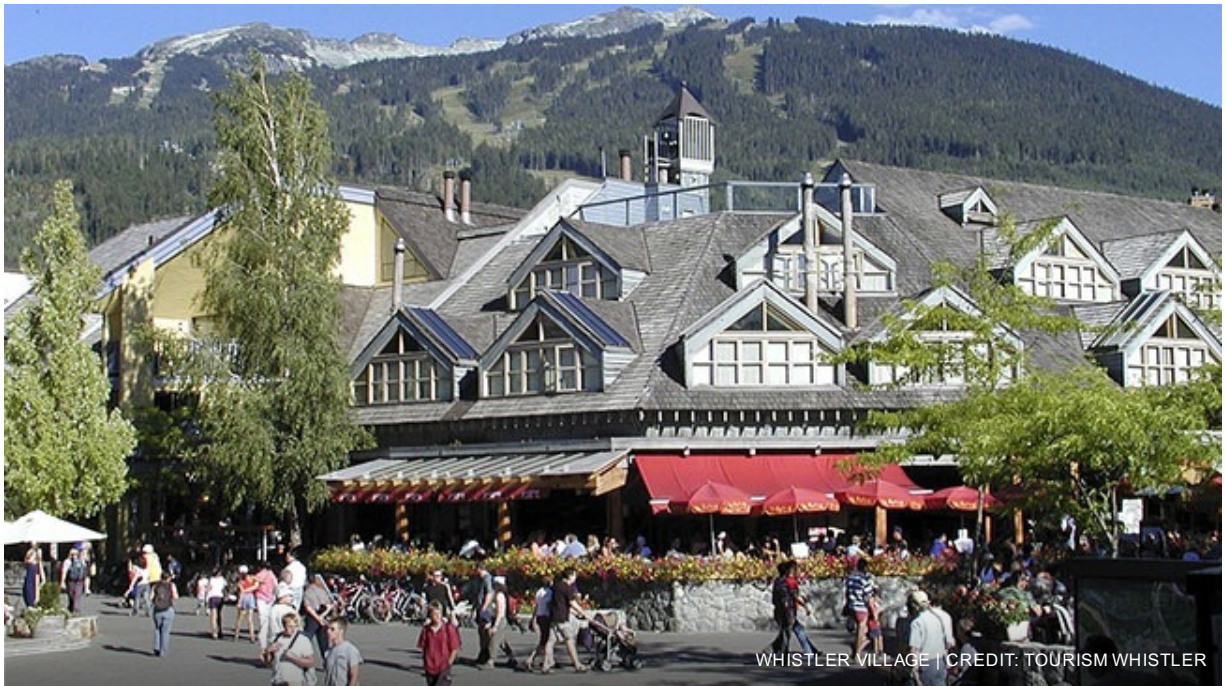
WHISTLER VILLAGE