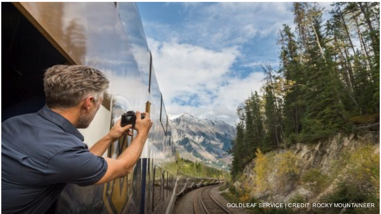
GOLDLEAF SERVICE | CREDIT: ROCKY MOUNTAINEER