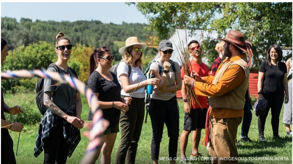
MÉTIS CROSSING