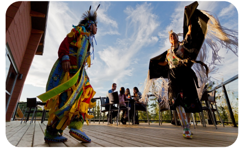
Metis Crossing