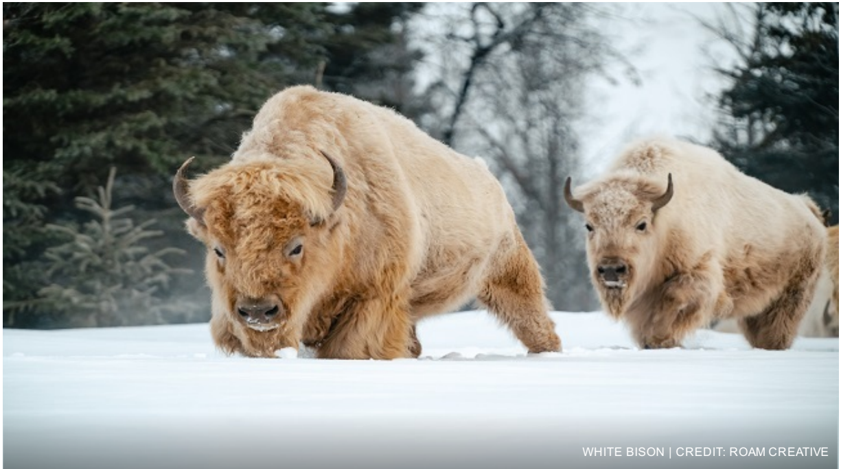
WHITE BISON