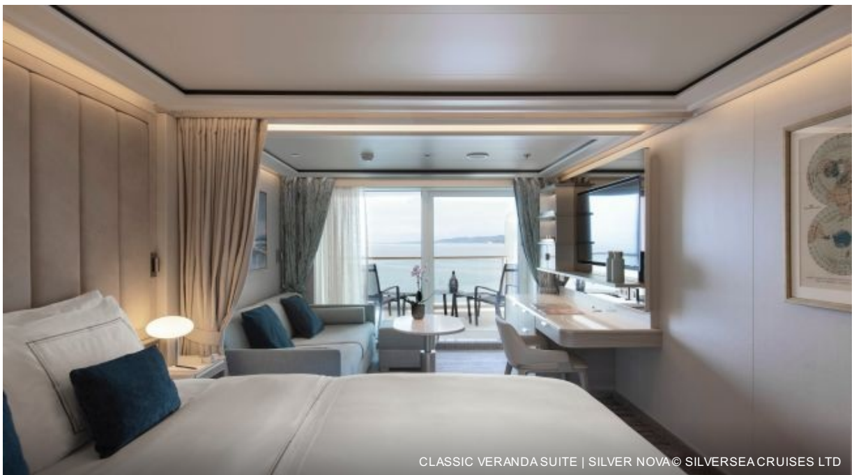
CLASSIC VERANDA SUITE | SILVER NOVA

The Classic Veranda Suite is located at the bow and aft of the ship, Classic Veranda Suite will offer travellers a taste of Silversea's famous on-board luxury. After a busy day of exploring, welcome home to the haven of the Classic Veranda Suite. With butler service, a queen-sized bed (which can be separated on demand) and a beautiful marble bathroom, you won't want to leave! However, the best part of the Classic Veranda suite is by far the large (5m2) private, teak veranda which offer sweeping views of the destination. Pure bliss.