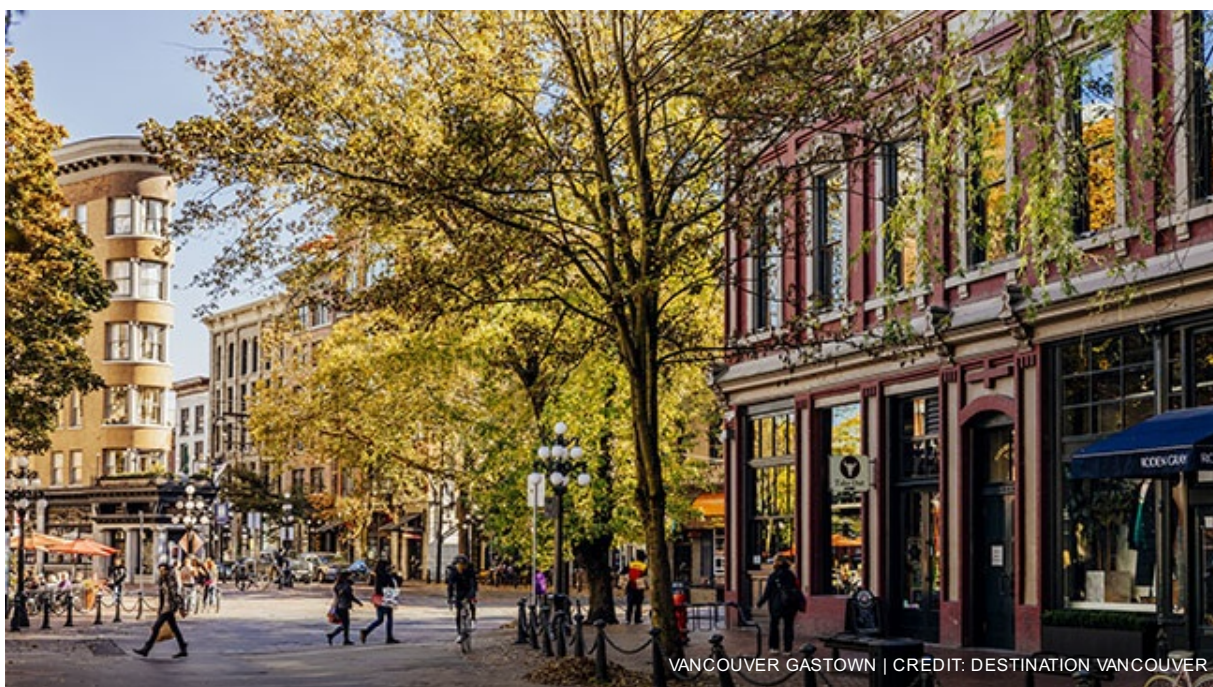
VANCOUVER GASTOWN