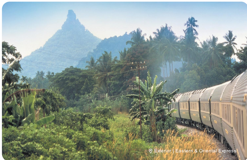
Exterior | Eastern & Oriental Express