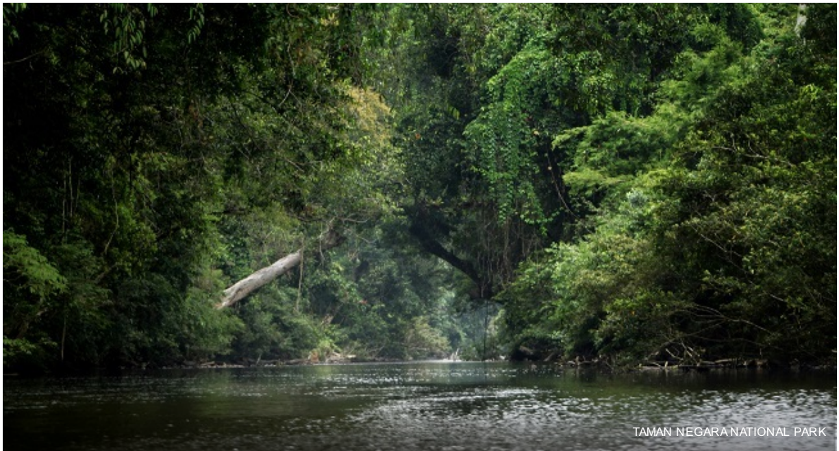
TAMAN NEGARA NATIONAL PARK