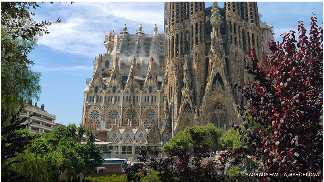
SAGRADA FAMILIA, BARCELONA