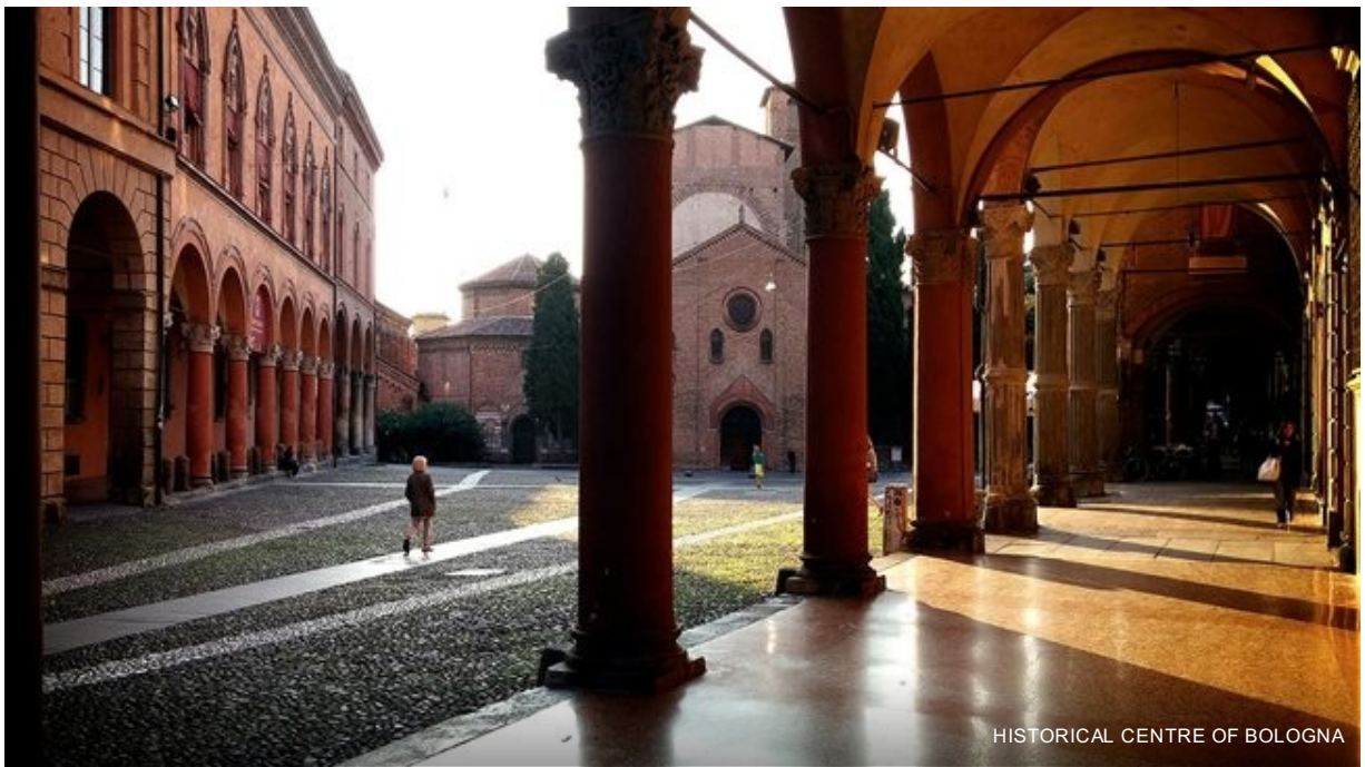
HISTORICAL CENTRE OF BOLOGNA