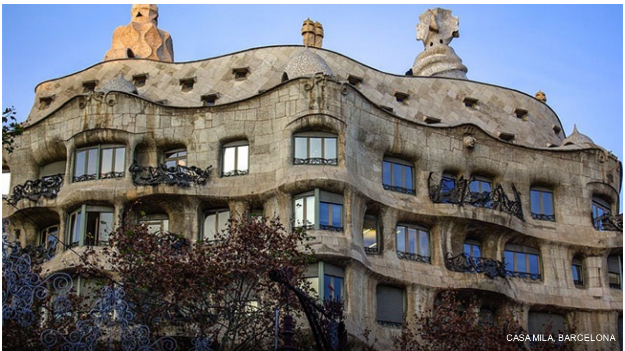
CASA MILA, BARCELONA