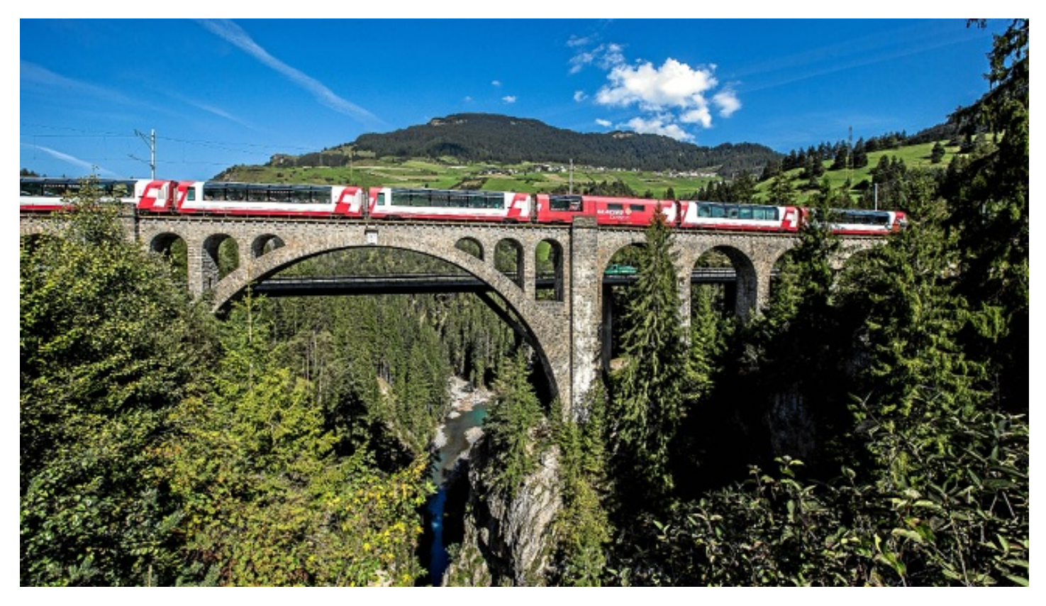
Prices are dynamic based on travel dates. Please proceed to Book Now or Contact Us for details.

Upgrade to 1st Class Rail throughout this itinerary.