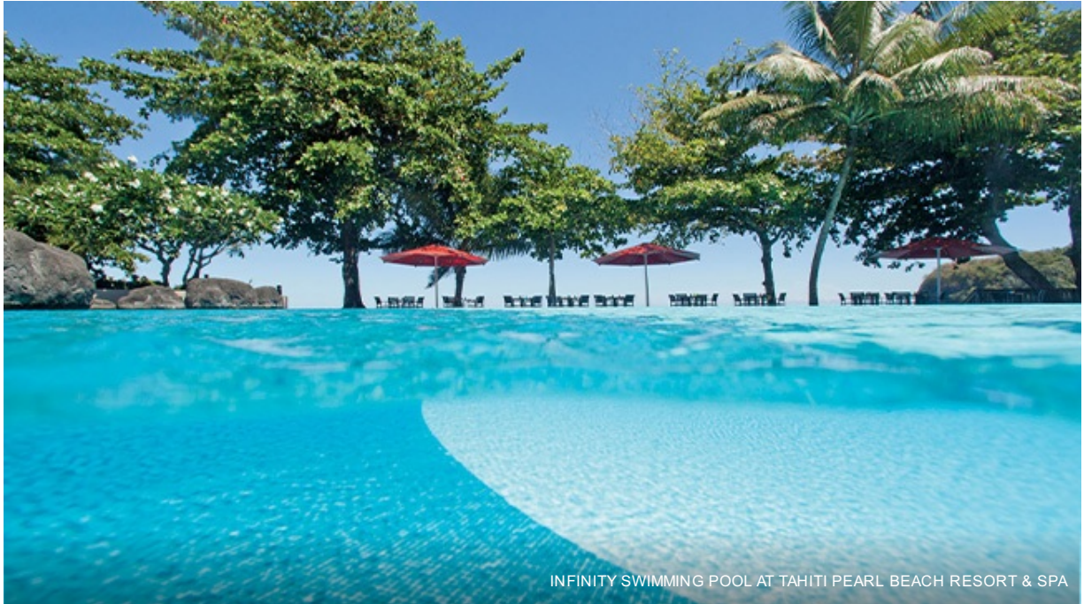
INFINITY SWIMMING POOL AT TAHITI PEARL BEACH RESORT & SPA

Overnight stay in Tahiti at Tahiti Pearl Beach Resort & Spa in an Ocean View Room.