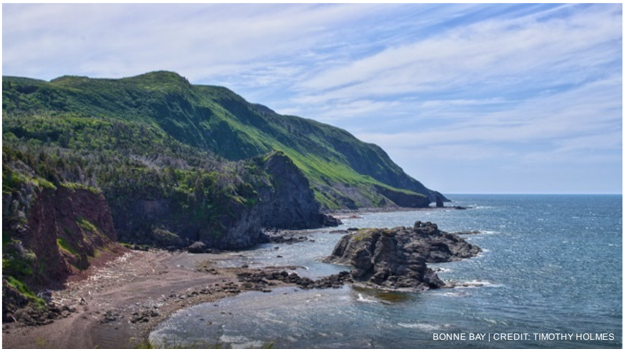
BONNE BAY