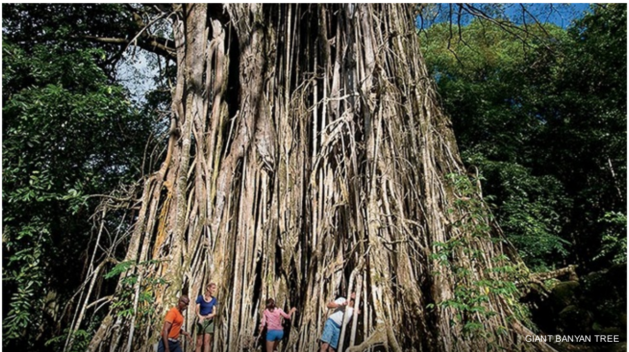
GIANT BANYAN TREE