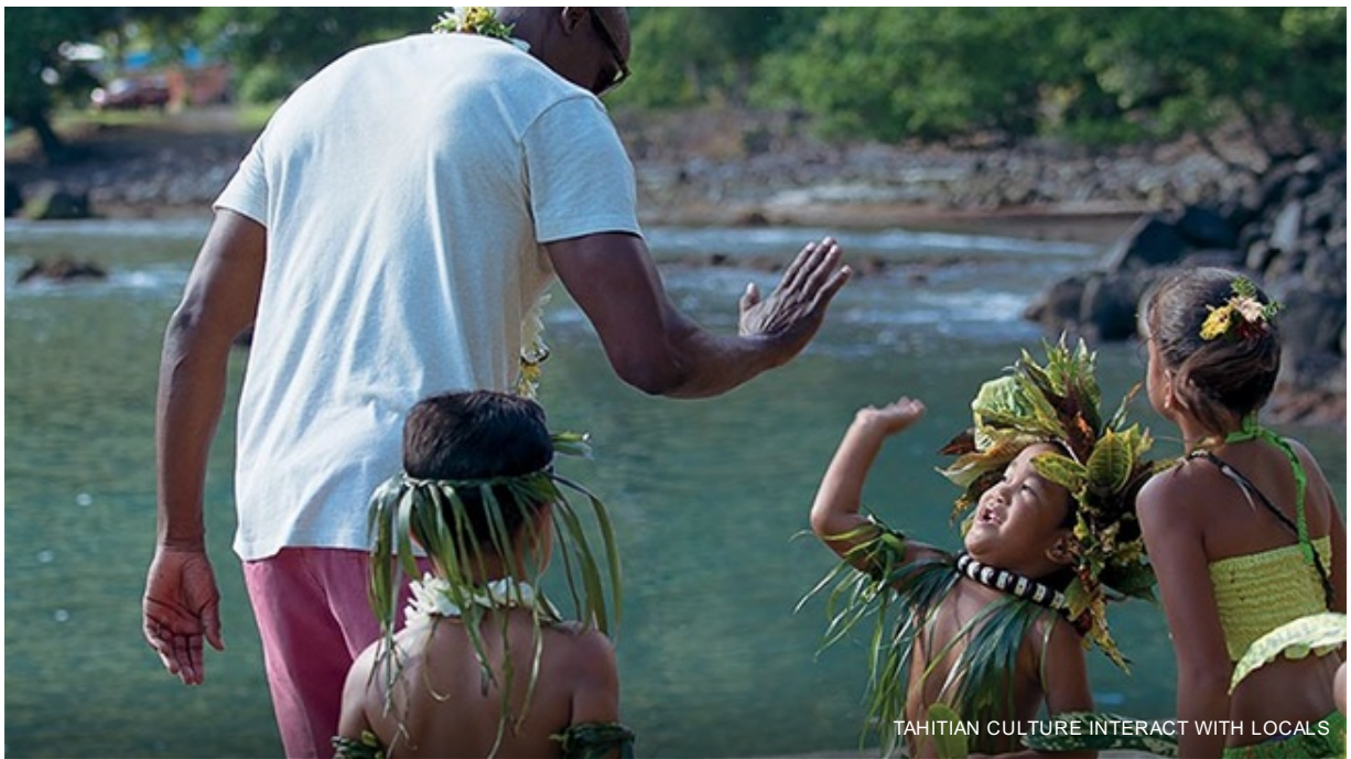
TAHITIAN CULTURE INTERACT WITH LOCALS