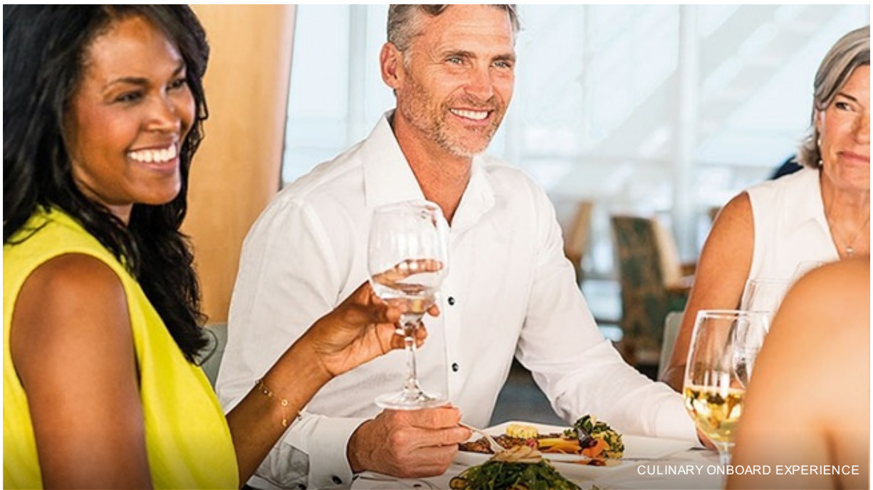
CULINARY ONBOARD EXPERIENCE