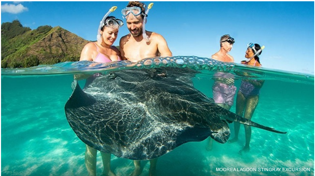
MOOREA LAGOON STINGRAY EXCURSION