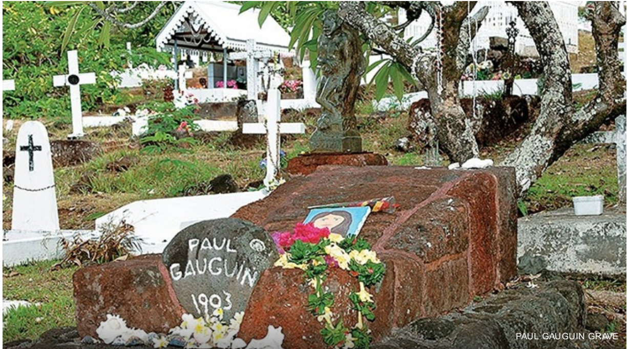
PAUL GAUGUIN GRAVE