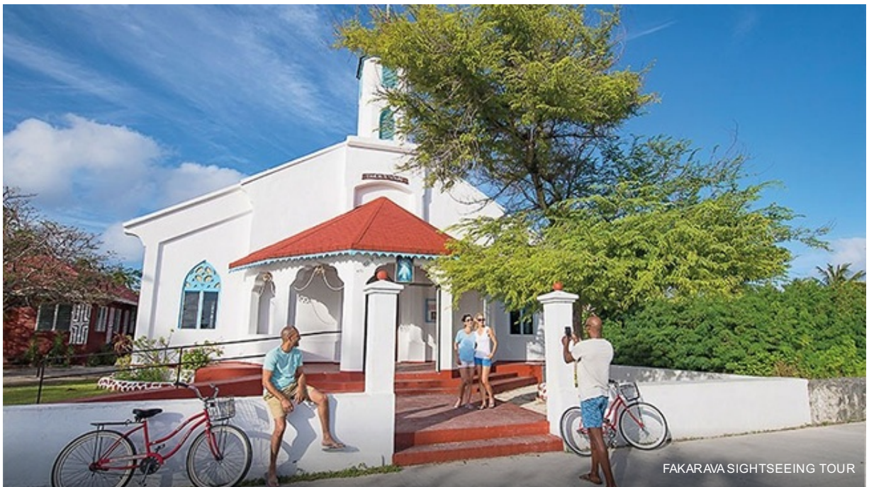
FAKARAVA SIGHTSEEING TOUR