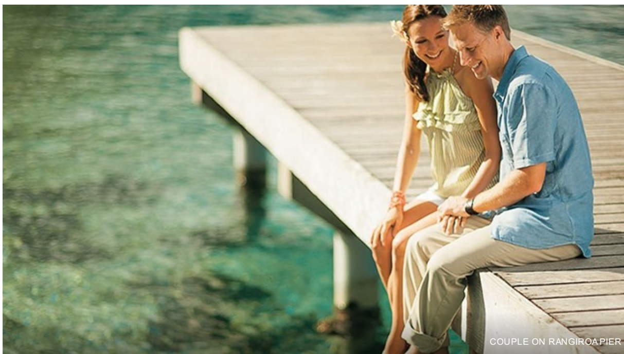
COUPLE ON RANGIROA PIER