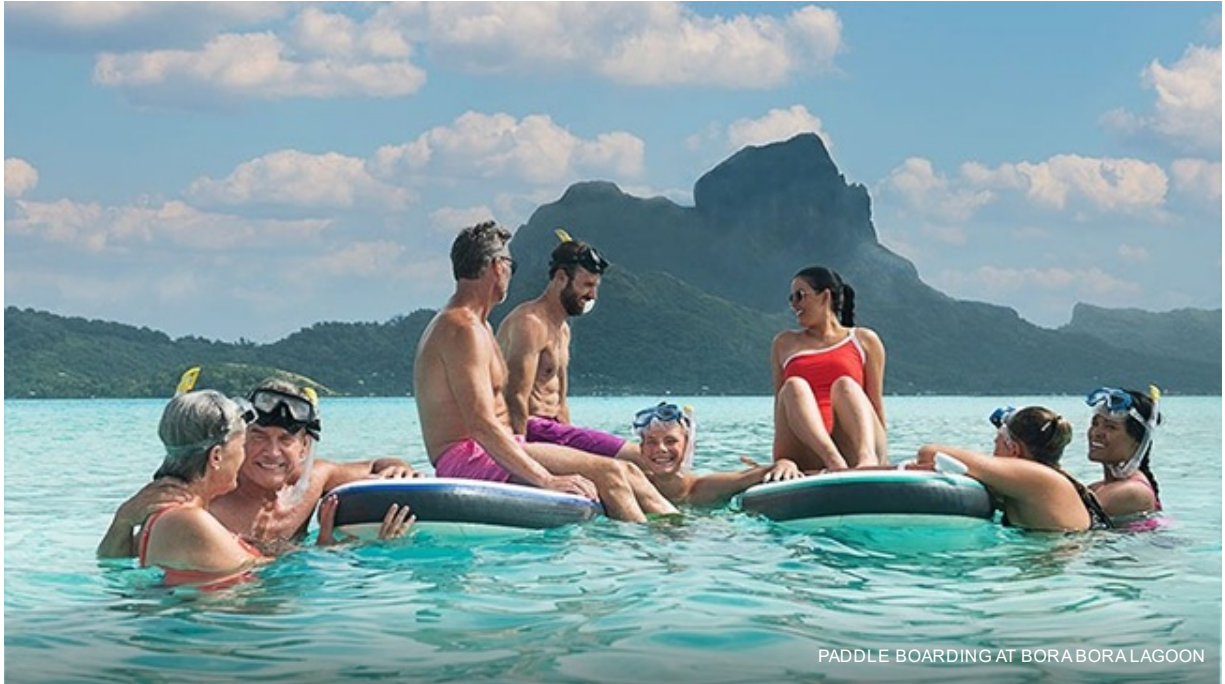
PADDLE BOARDING AT BORA BORA LAGOON