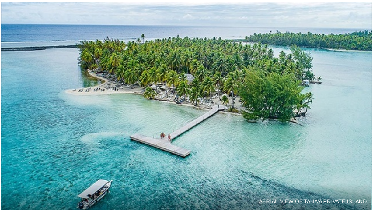
AERIAL VIEW OF TAHA'A PRIVATE ISLAND