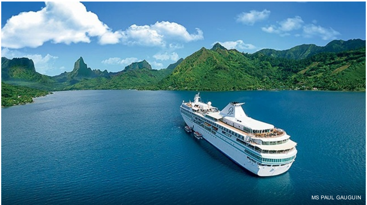
MS PAUL GAUGUIN