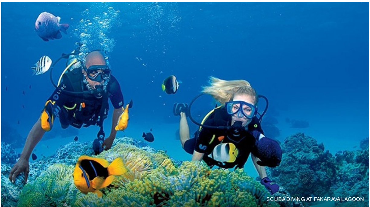
SCUBA DIVING AT FAKARAVA LAGOON