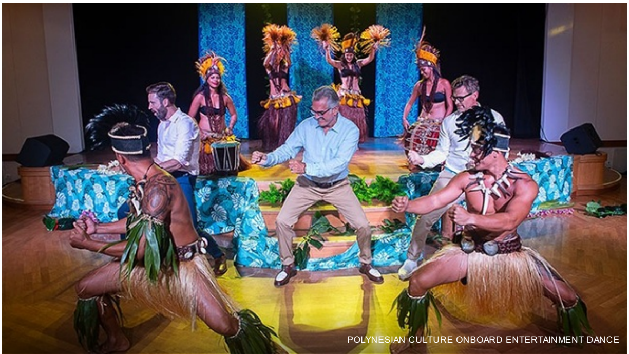
POLYNESIAN CULTURE ONBOARD ENTERTAINMENT DANCE