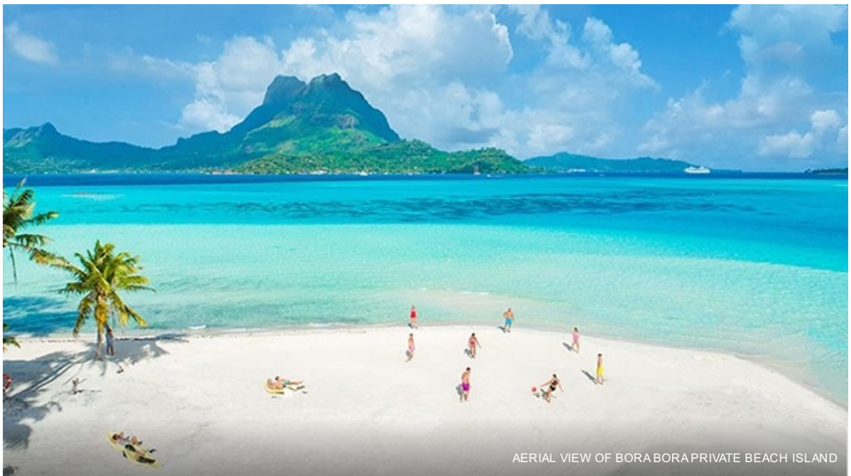
AERIAL VIEW OF BORA BORA PRIVATE BEACH ISLAND