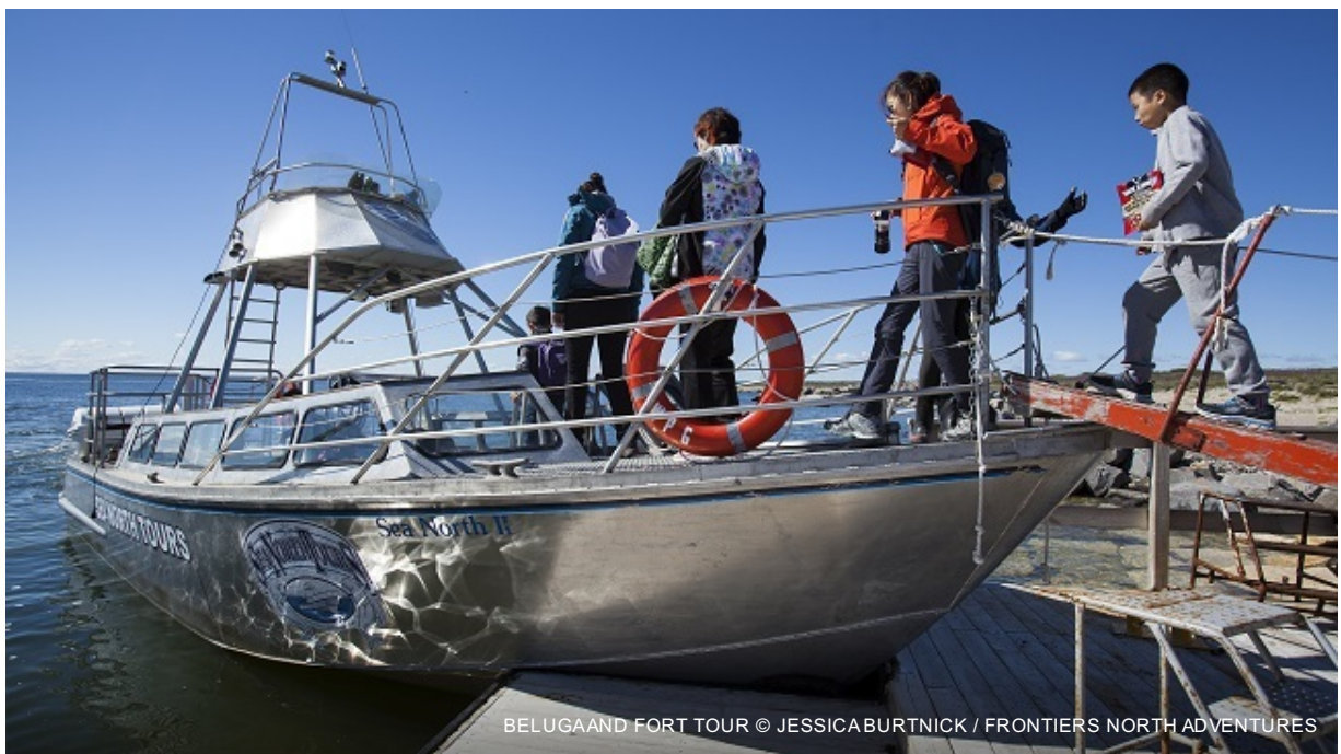
BELUGA AND FORT TOUR