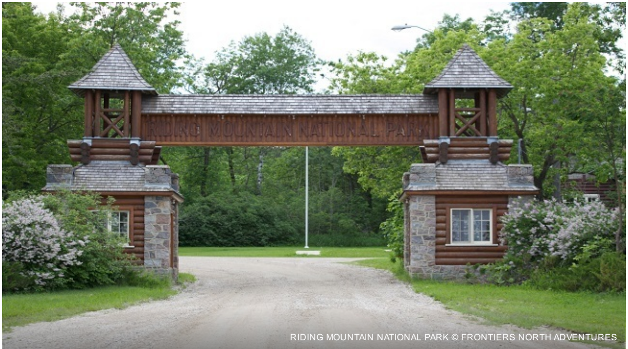
RIDING MOUNTAIN NATIONAL PARK