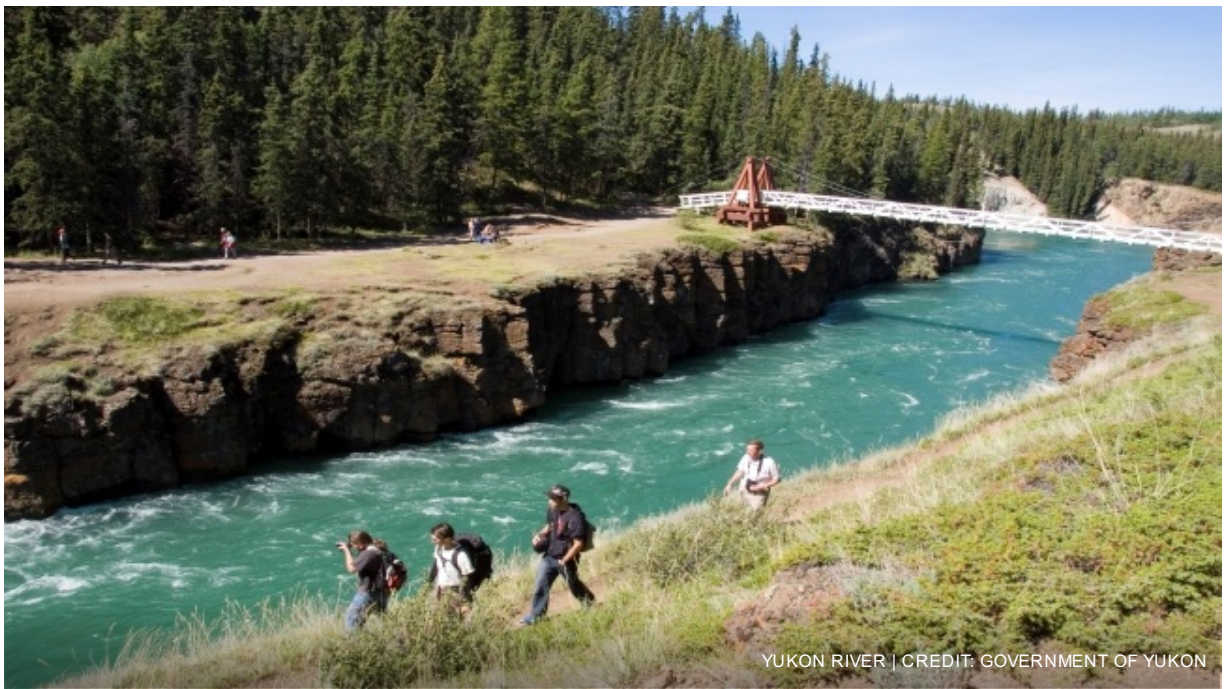
YUKON RIVER