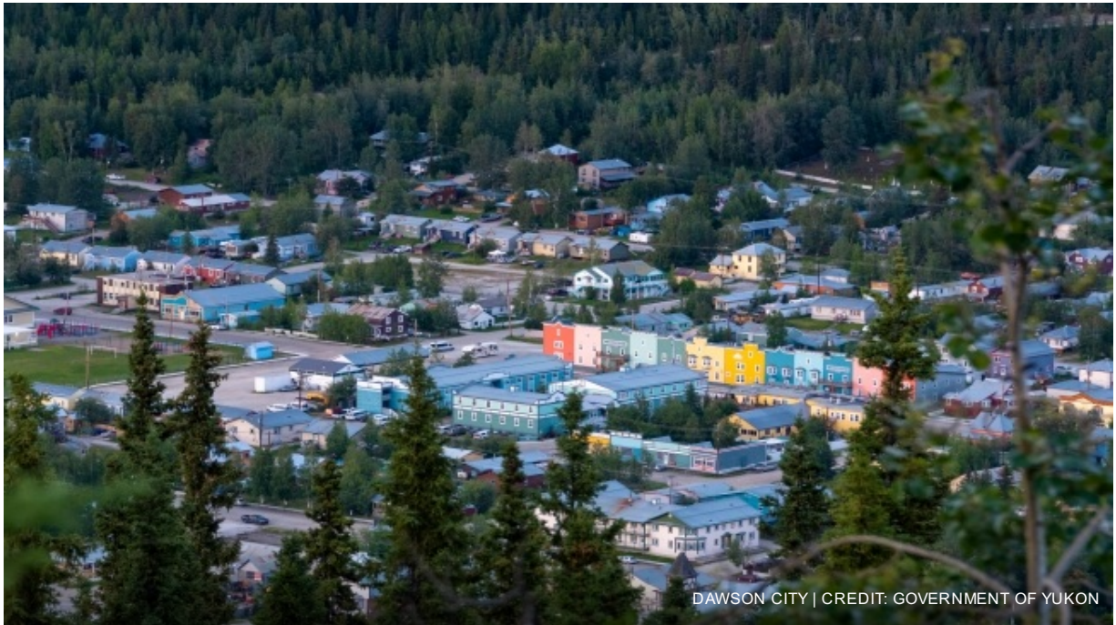
DAWSON CITY

Overnights in Dawson City at the Aurora Inn