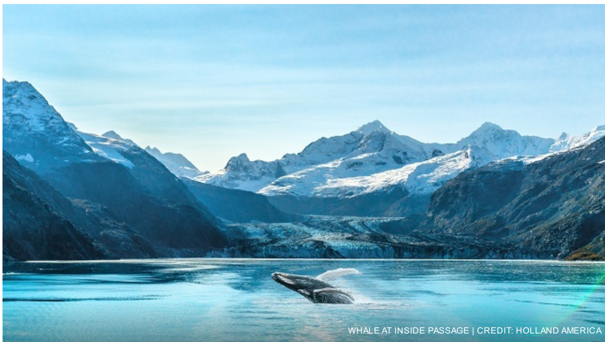
WHALE AT INSIDE PASSAGE