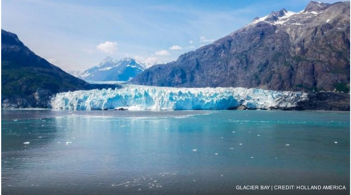
GLACIER BAY