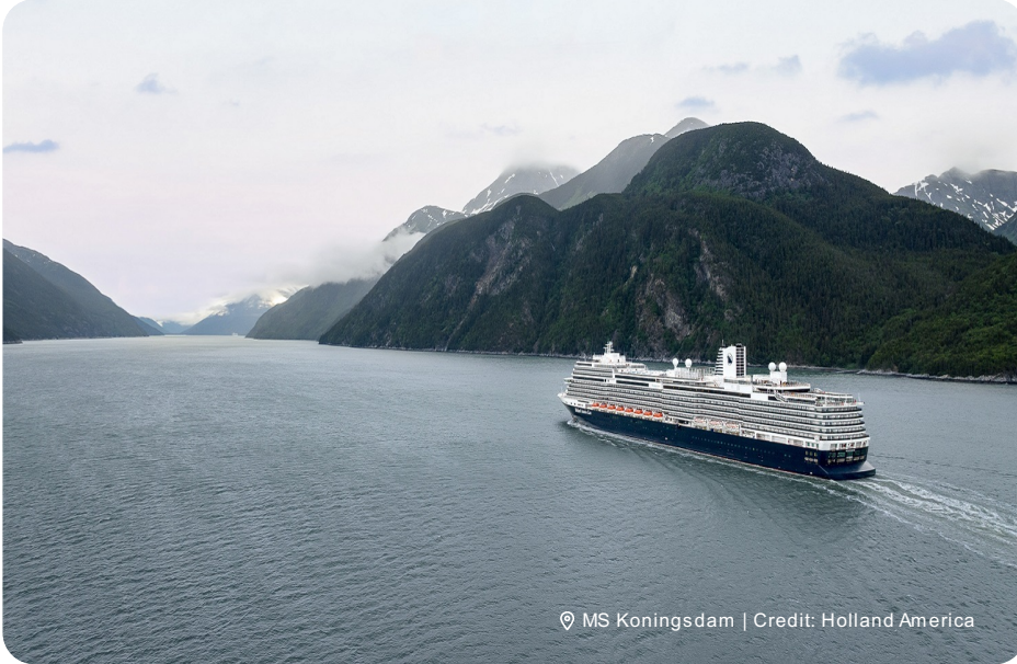
MS Koningsdam