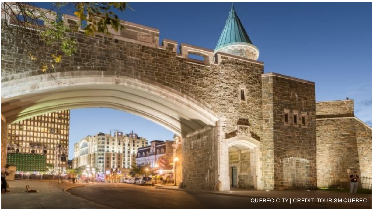
QUEBEC CITY