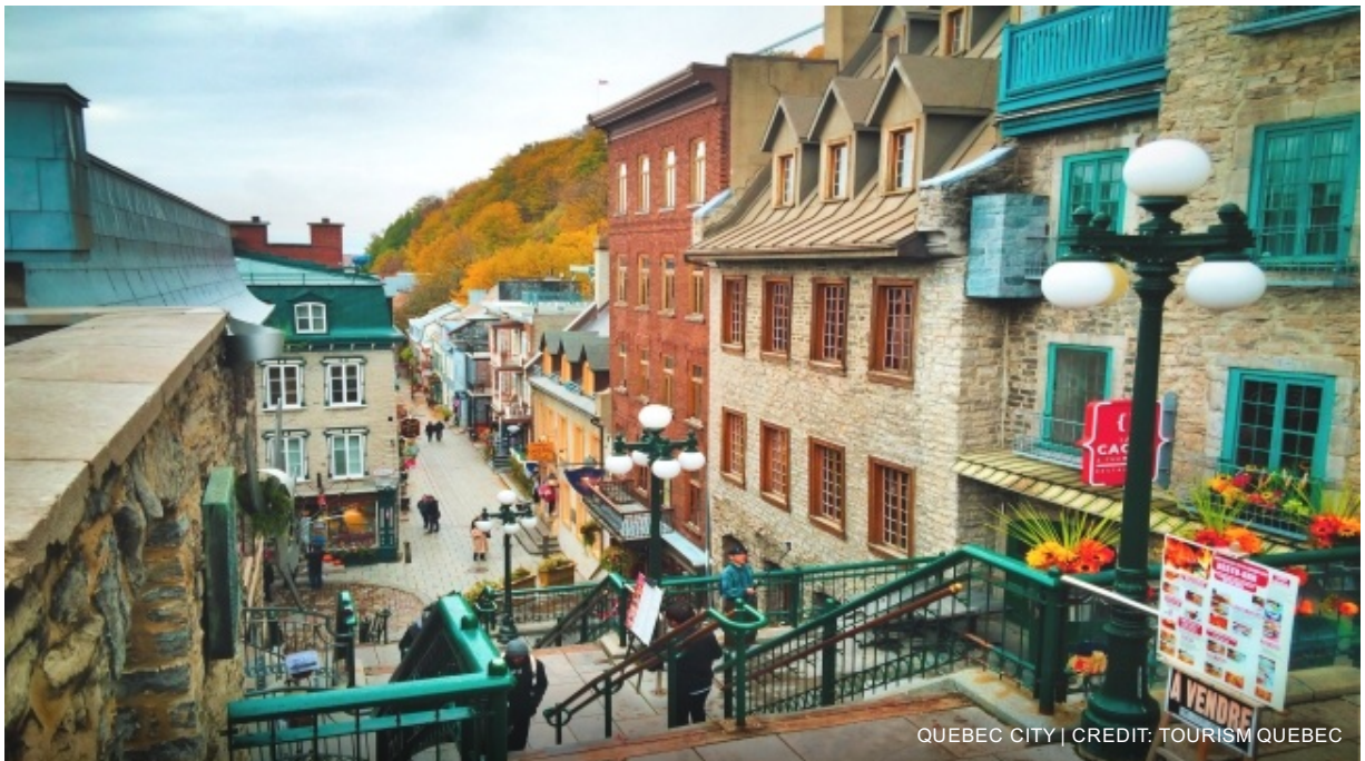
QUEBEC CITY

Overnight in Quebec City at the Fairmont Chateau Frontenac