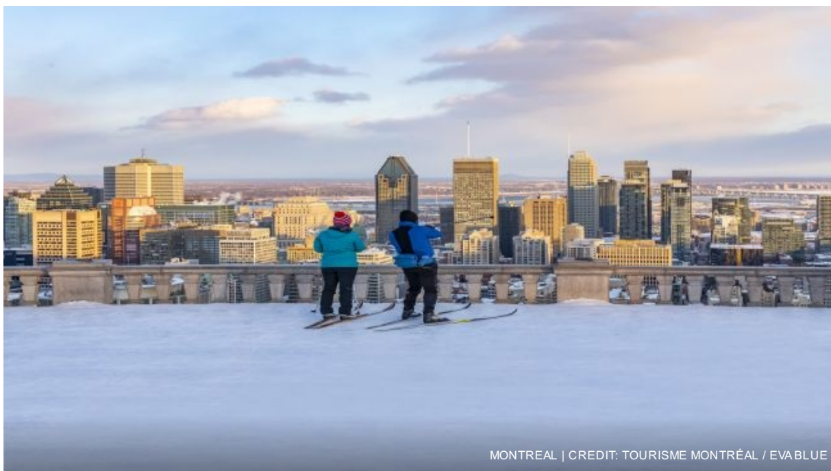
MONTREAL

Overnight in Montreal at the Fairmont Queen Elizabeth