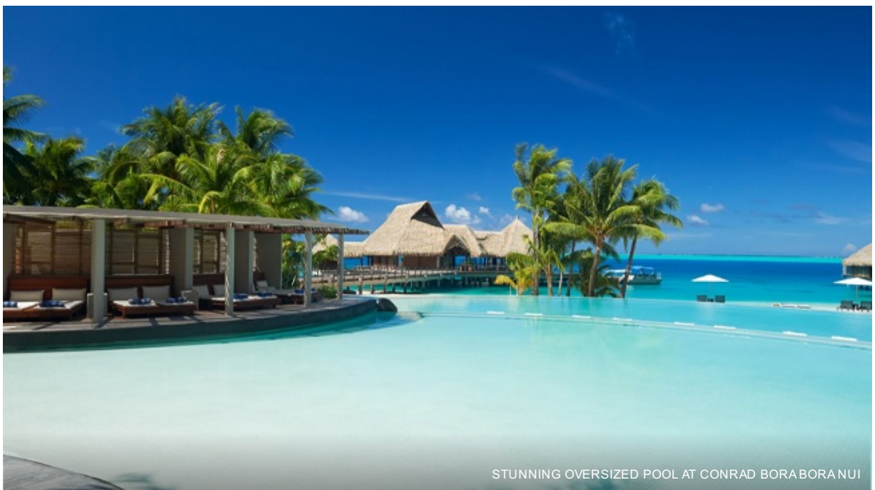
STUNNING OVERSIZED POOL AT CONRAD BORABORANUI