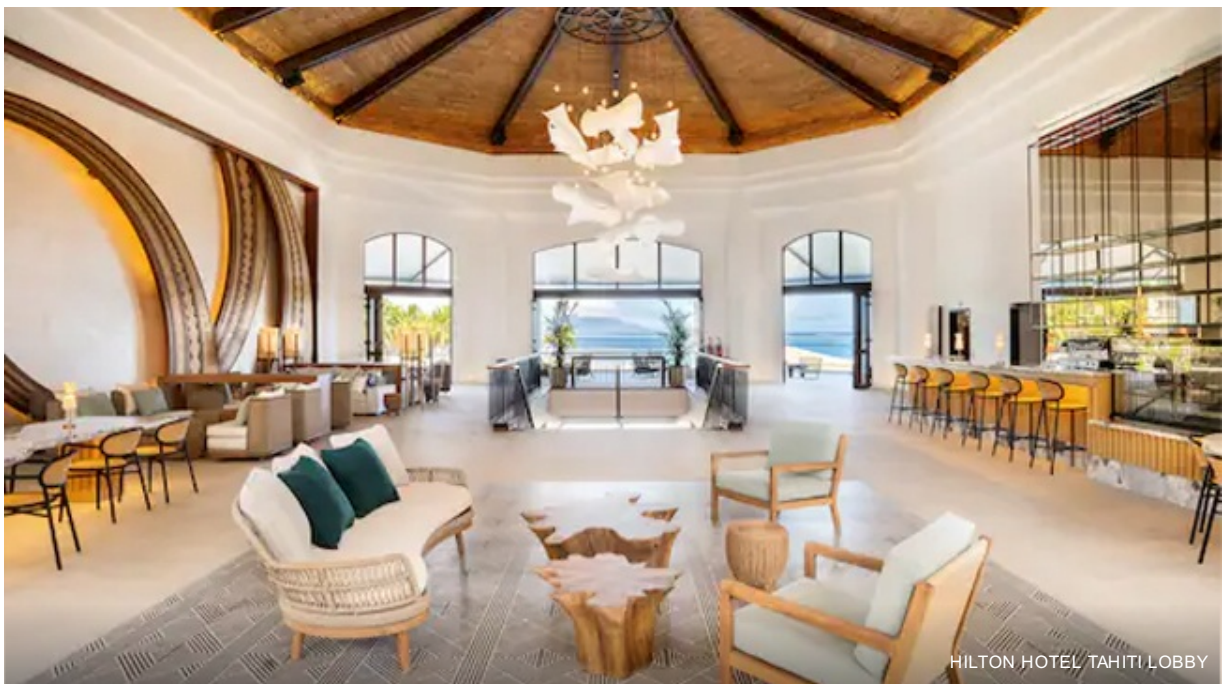
HILTON HOTEL TAHITI LOBBY

Overnight stay in Tahiti at Hilton Hotel Tahiti in a Standard Room.