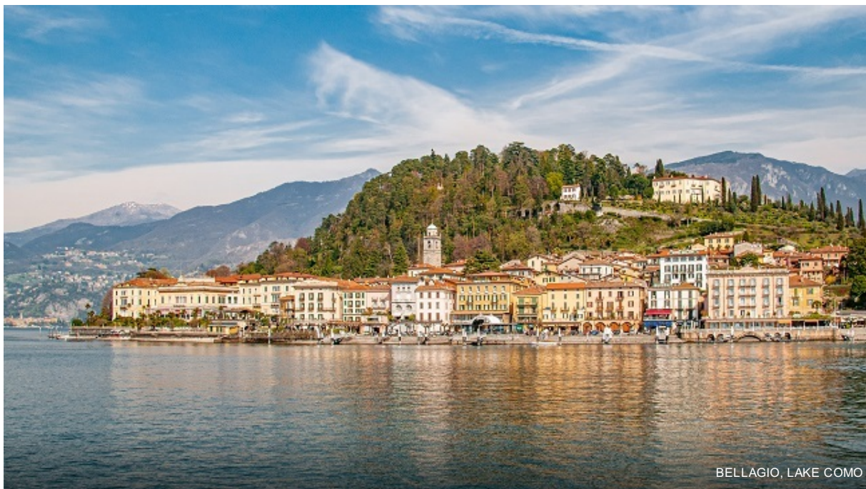
BELLAGIO, LAKE COMO