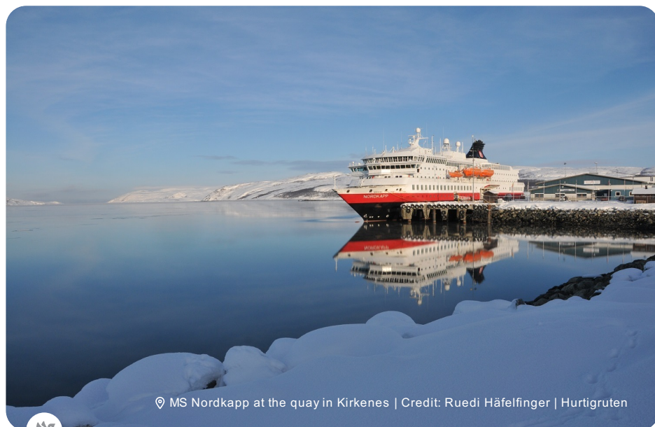
MS Nordkapp at the quay in Kirkenes