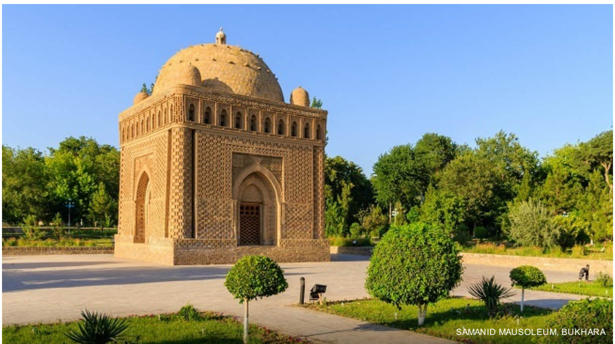
SAMANID MAUSOLEUM, BUKHARA