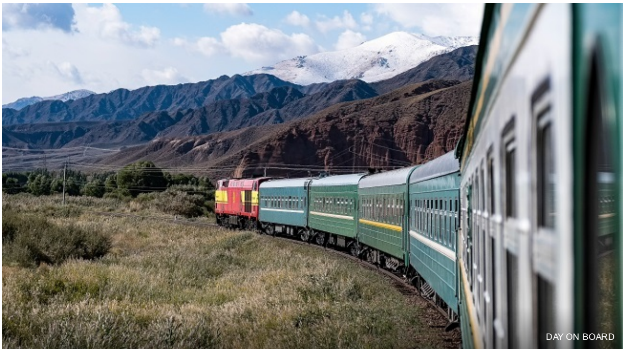
DAY ON BOARD