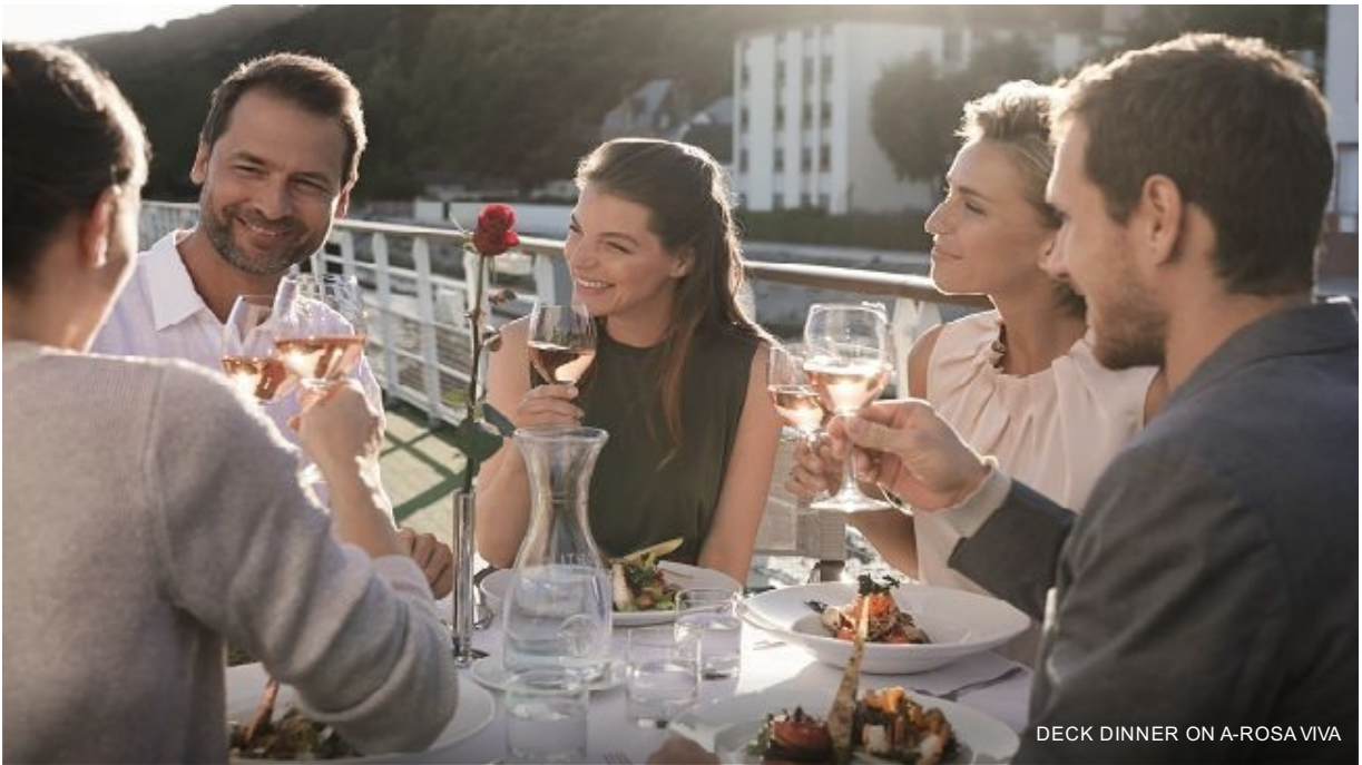
DECK DINNER ON A-ROSA VIVA