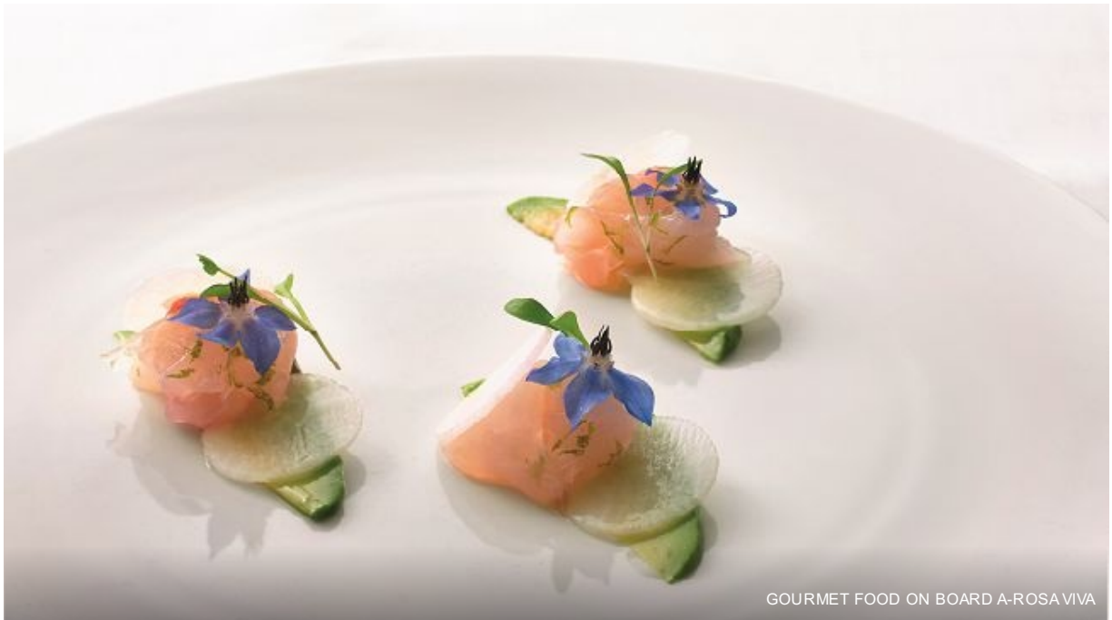
GOURMET FOOD ON BOARD A-ROSA VIVA