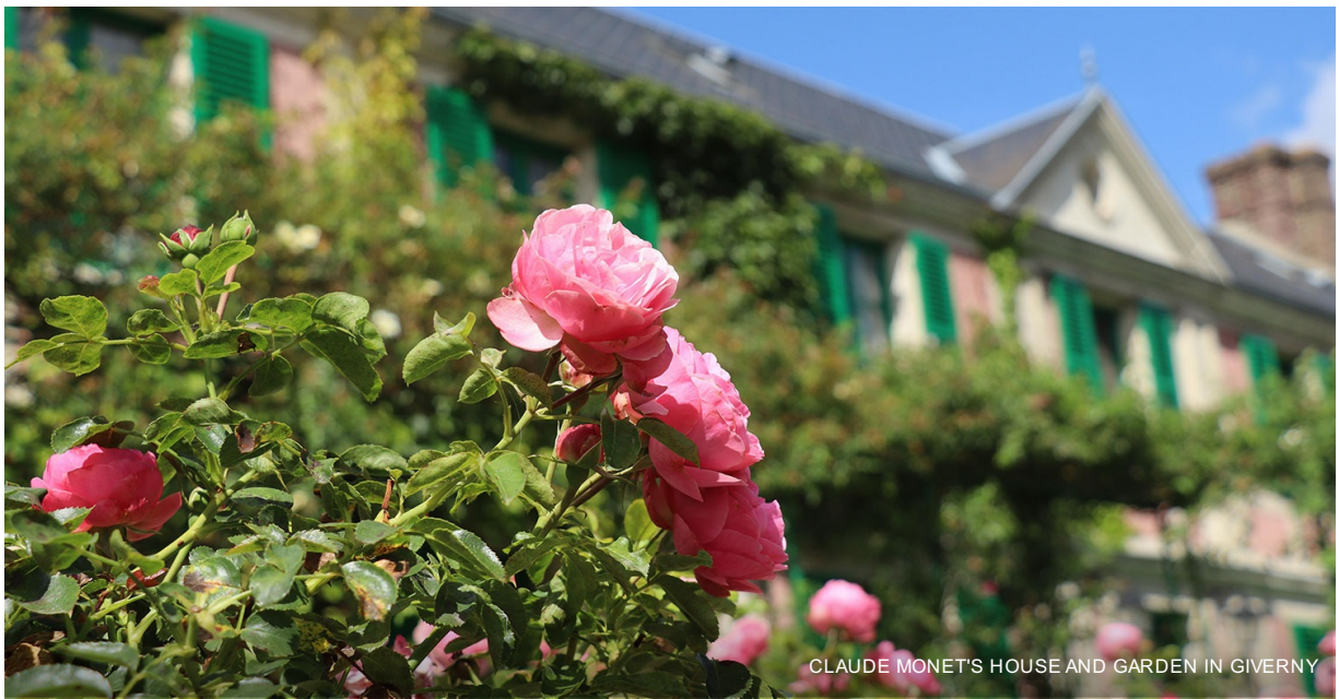
CLAUDE MONET'S HOUSE AND GARDEN IN GIVERNY