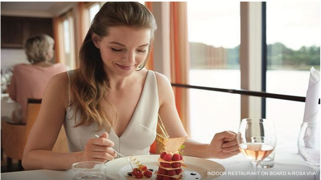
INDOOR RESTAURANT ON BOARD A-ROSA VIVA