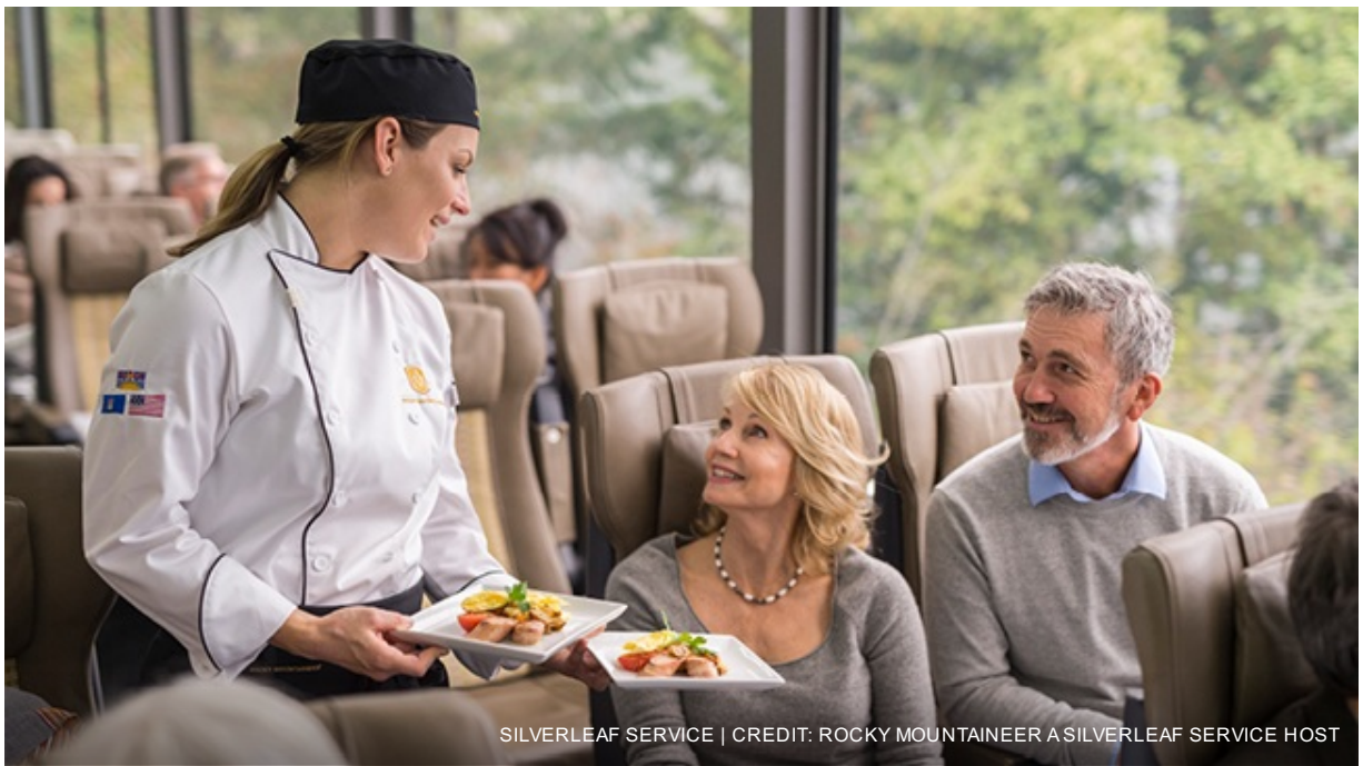
SILVERLEAF SERVICE A SILVERLEAF SERVICE HOST