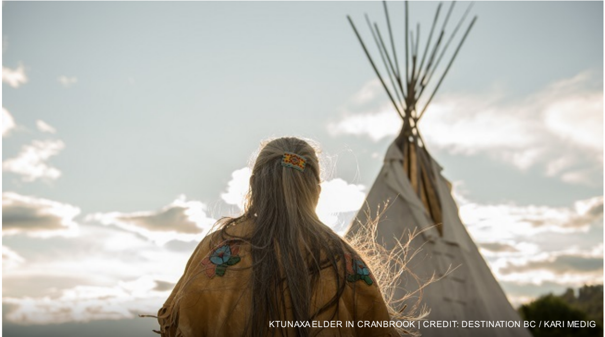
KTUNAXA ELDER IN CRANBROOK

Overnight in Nelson at Prestige Lakeside Resort