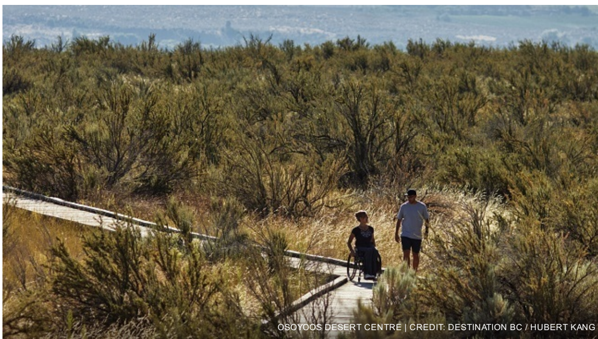
OSOYOOS DESERT CENTRE

Overnight in Osoyoos at Watermark Beach Resort