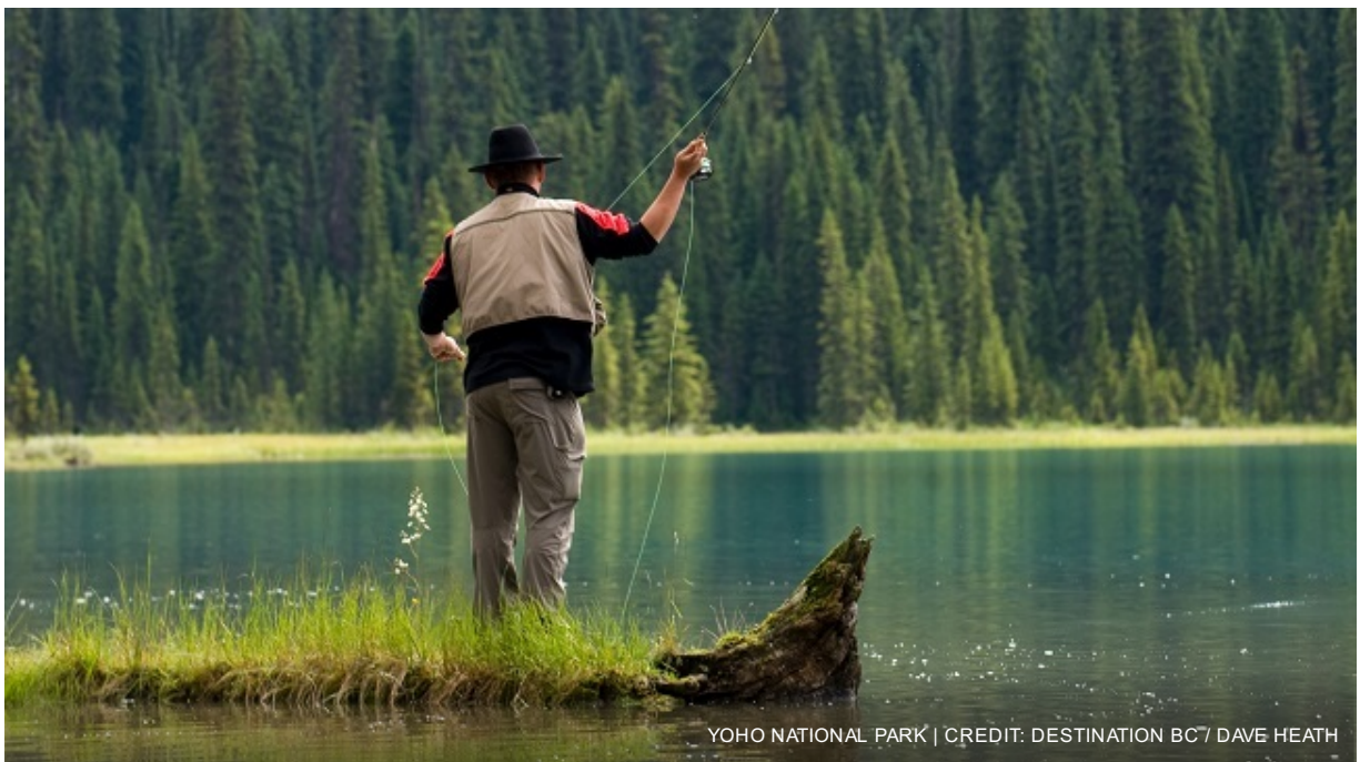
YHO NATIONAL PARK

Overnight in Field at Emerald Lake Lodge