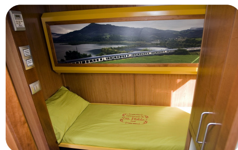
El Expreso de La Robla