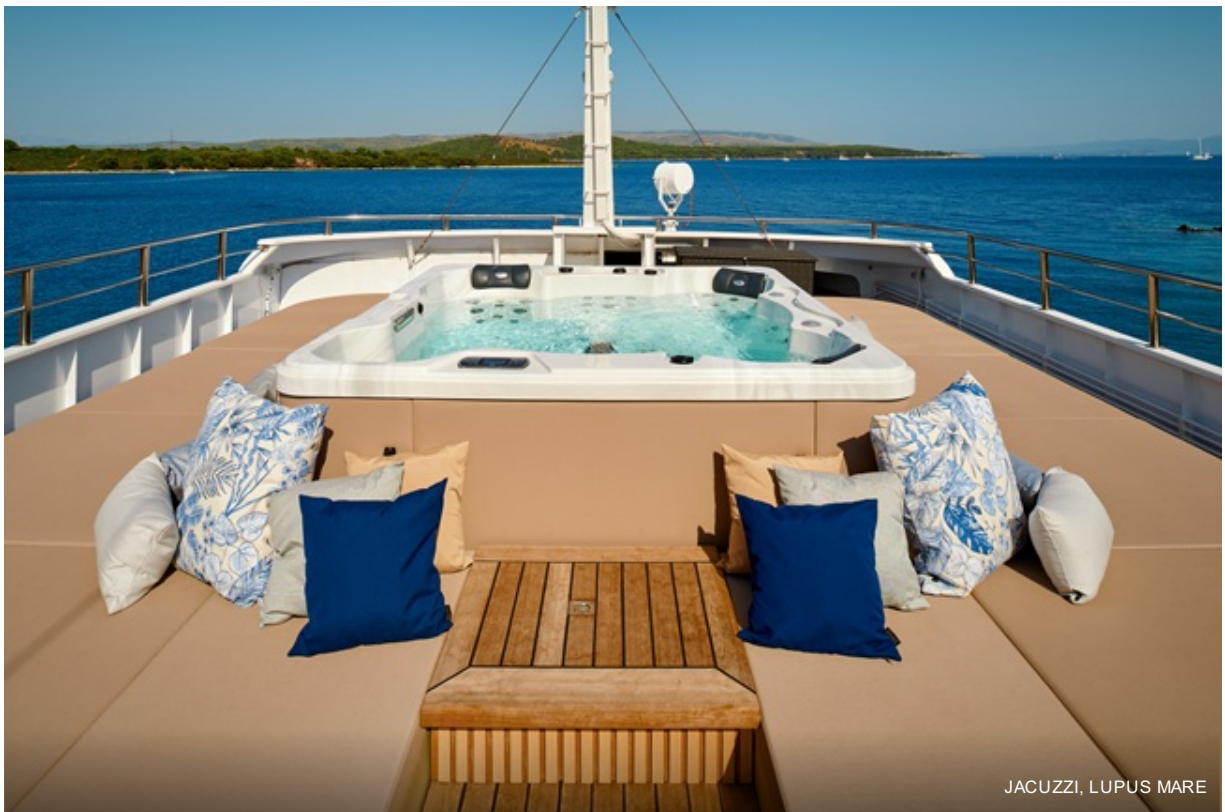
JACUZZI, LUPUS MARE