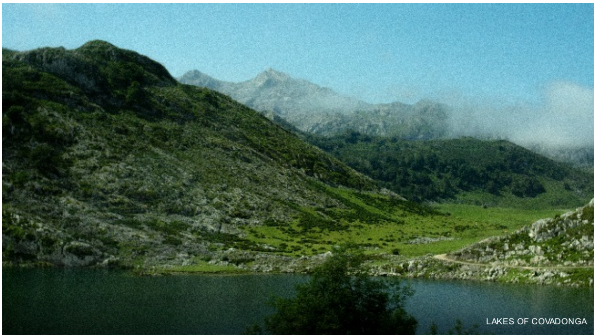
LAKES OF COVADONGA