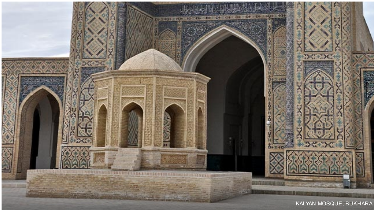
KALYAN MOSQUE, BUKHARA