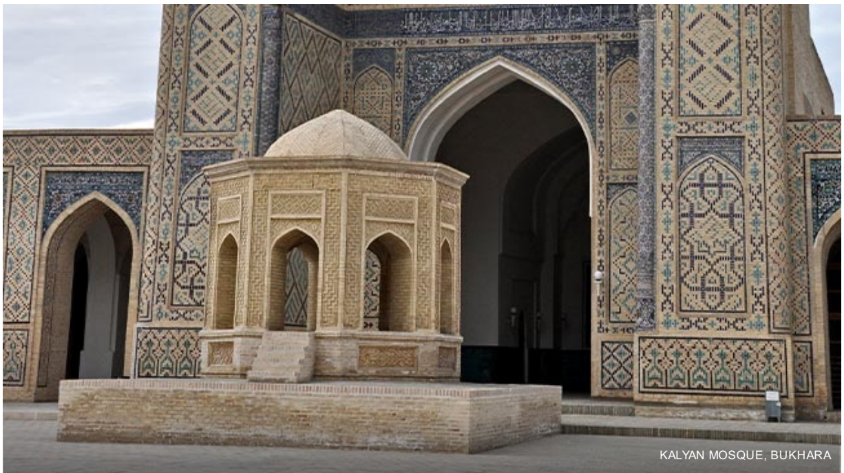
KALYAN MOSQUE, BUKHARA