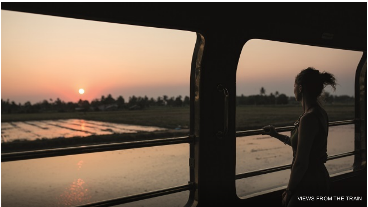
VIEWS FROM THE TRAIN