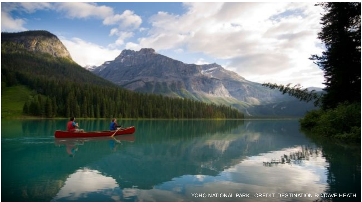
YOHO NATIONAL PARK

Overnight in Banff at the Banff Caribou Lodge & Spa (or similar)