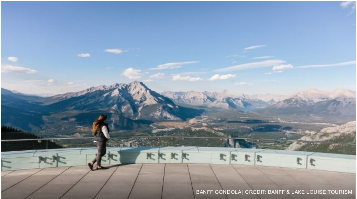
BANFF GONDOLA

Overnight in Banff at the Banff Caribou Lodge & Spa (or similar)