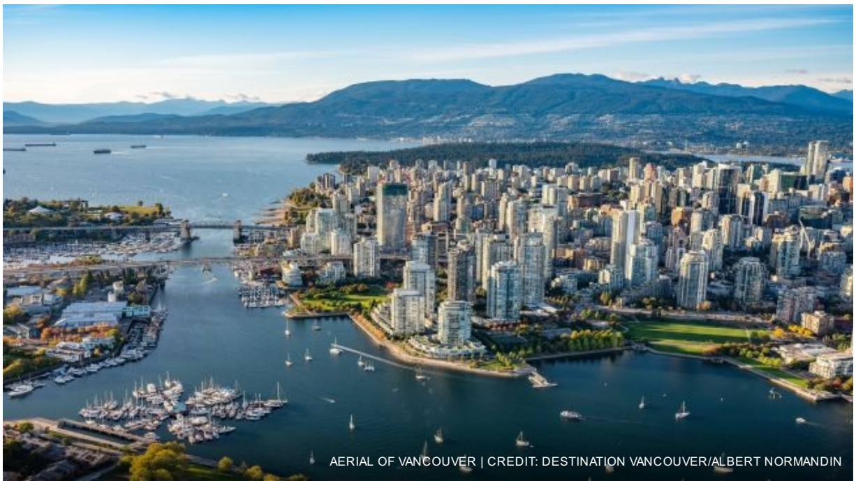
AERIAL OF VANCOUVER