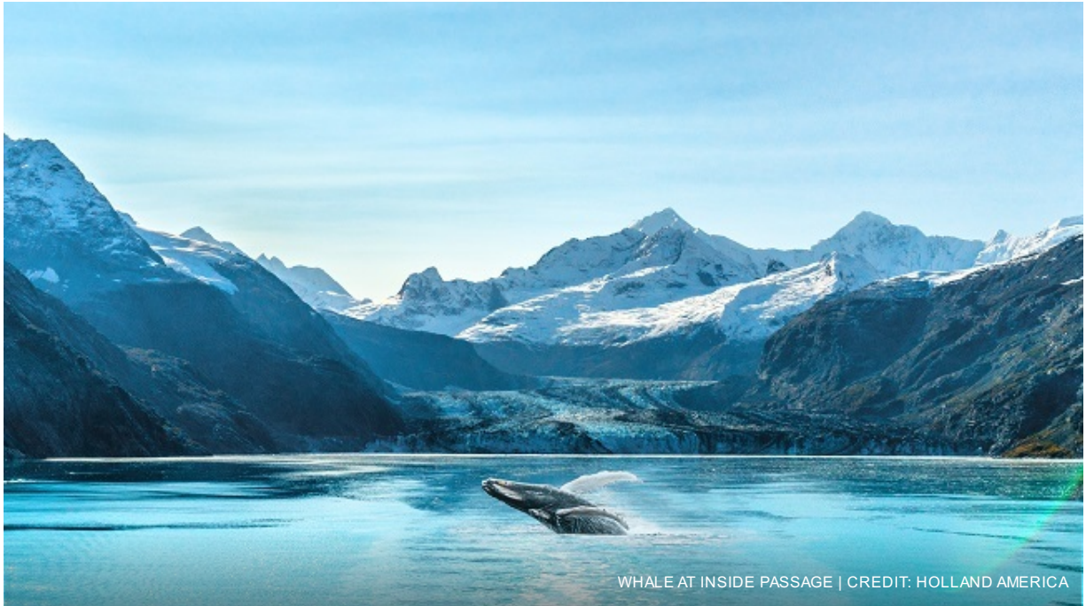
WHALE AT INSIDE PASSAGE