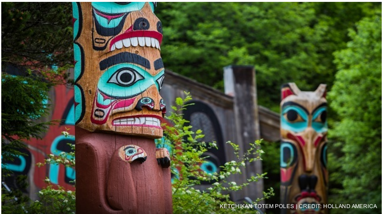
KETCHIKAN TOTEM POLES