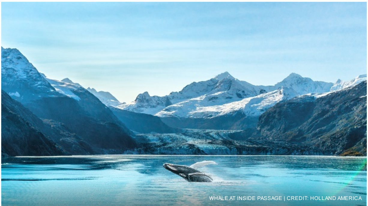
WHALE AT INSIDE PASSAGE