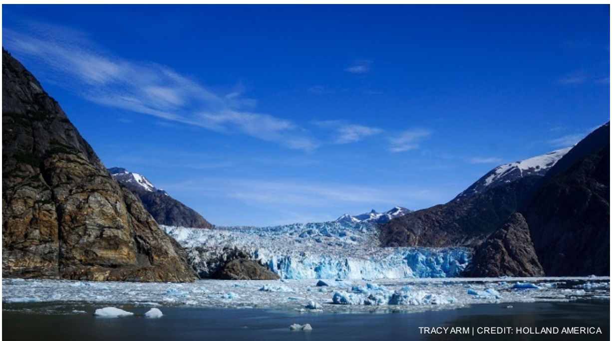
TRACY ARM