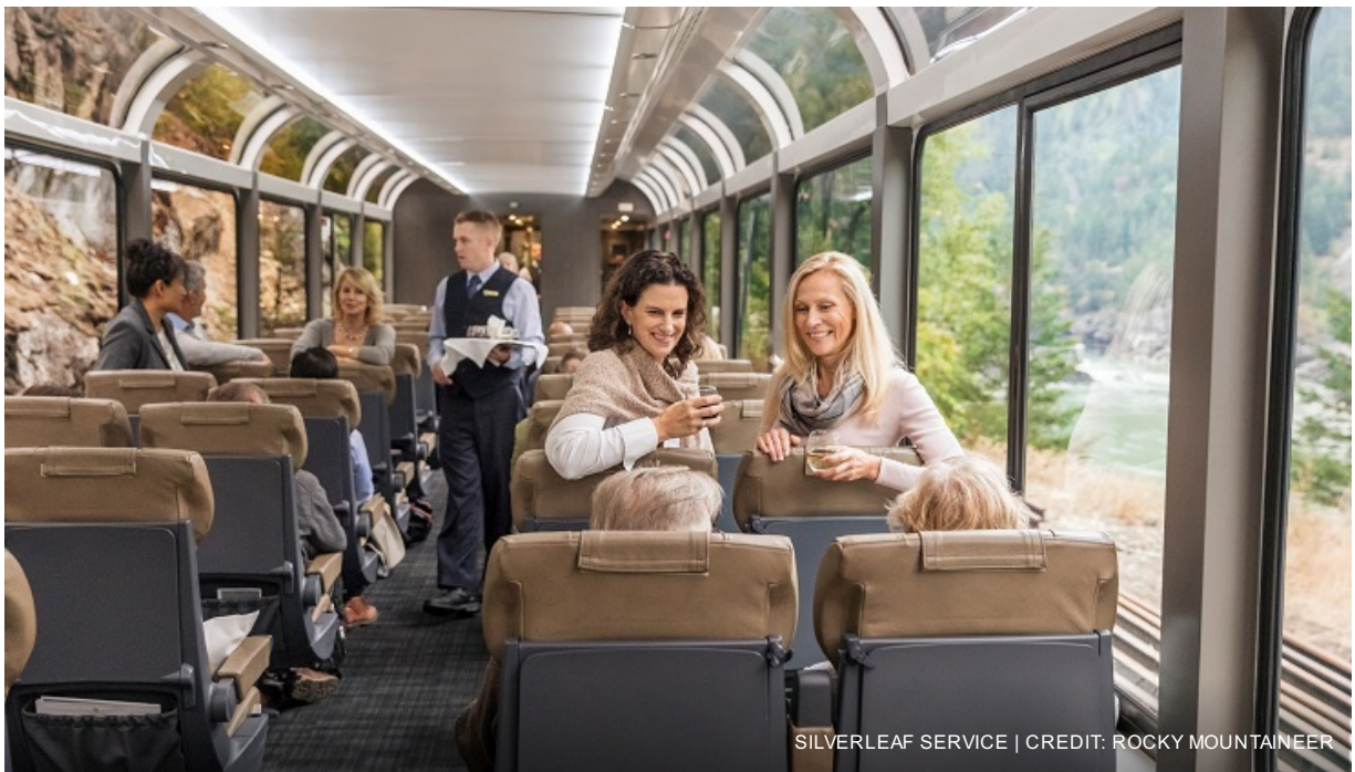
SILVERLEAF SERVICE