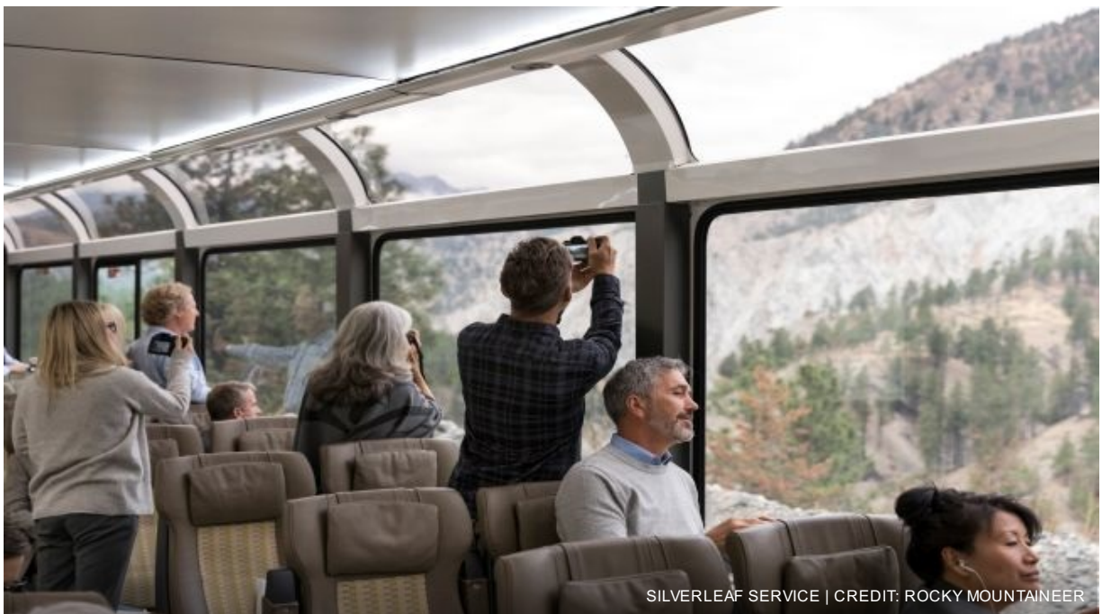
SILVERLEAF SERVICE