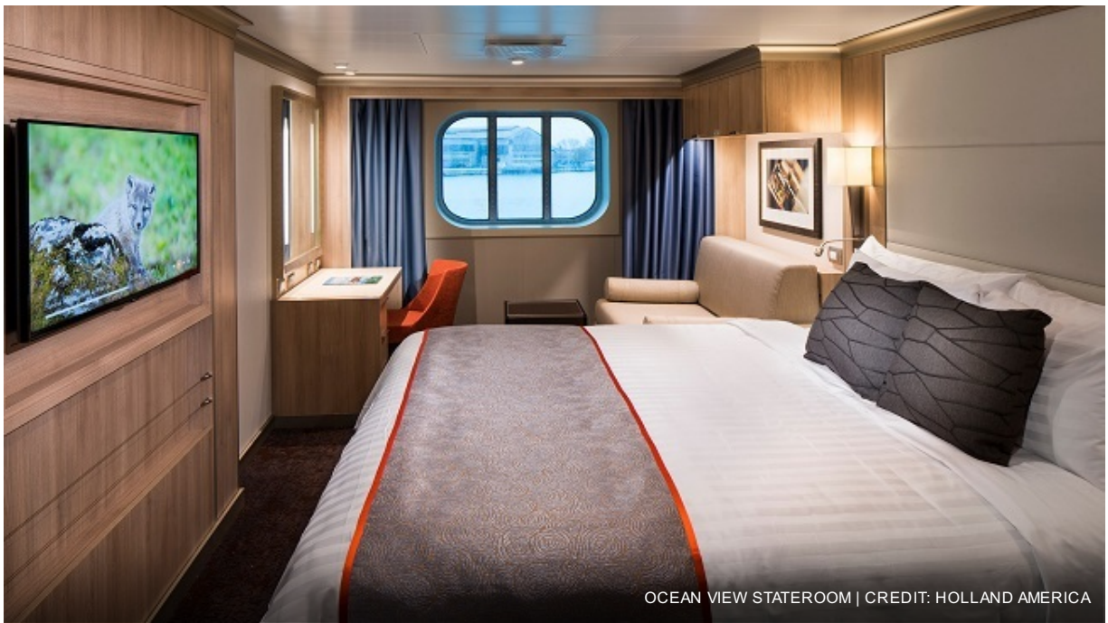
OCEAN VIEW STATEROOM