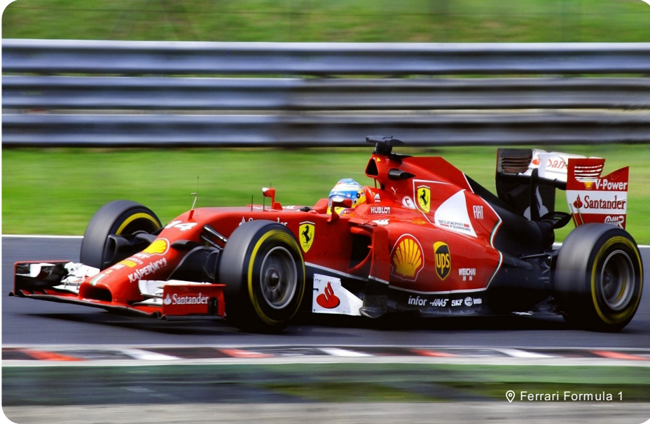
Ferrari Formula 1