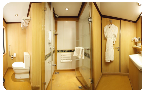
📍 Maharajas' Express