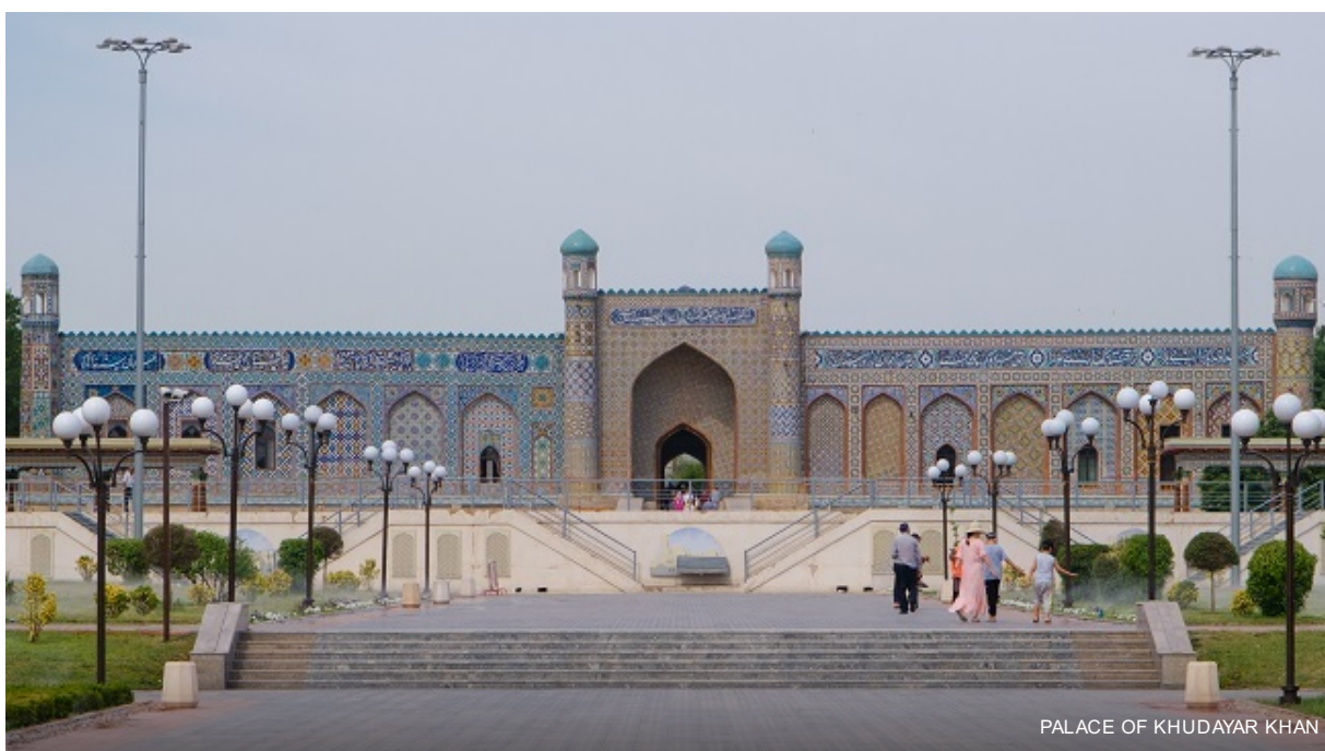
PALACE OF KHUDAYAR KHAN