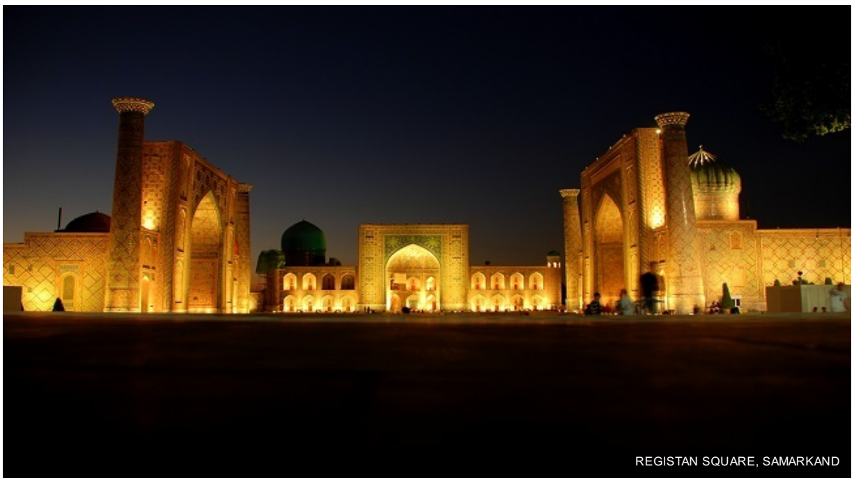
REGISTAN SQUARE, SAMARKAND