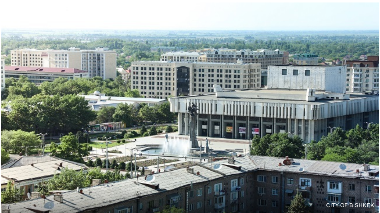
CITY OF BISHKEK