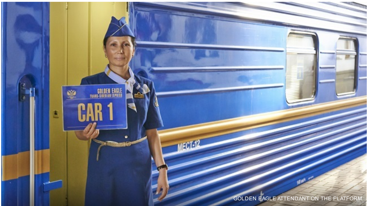
GOLDEN EAGLE ATTENDANT ON THE PLATFORM