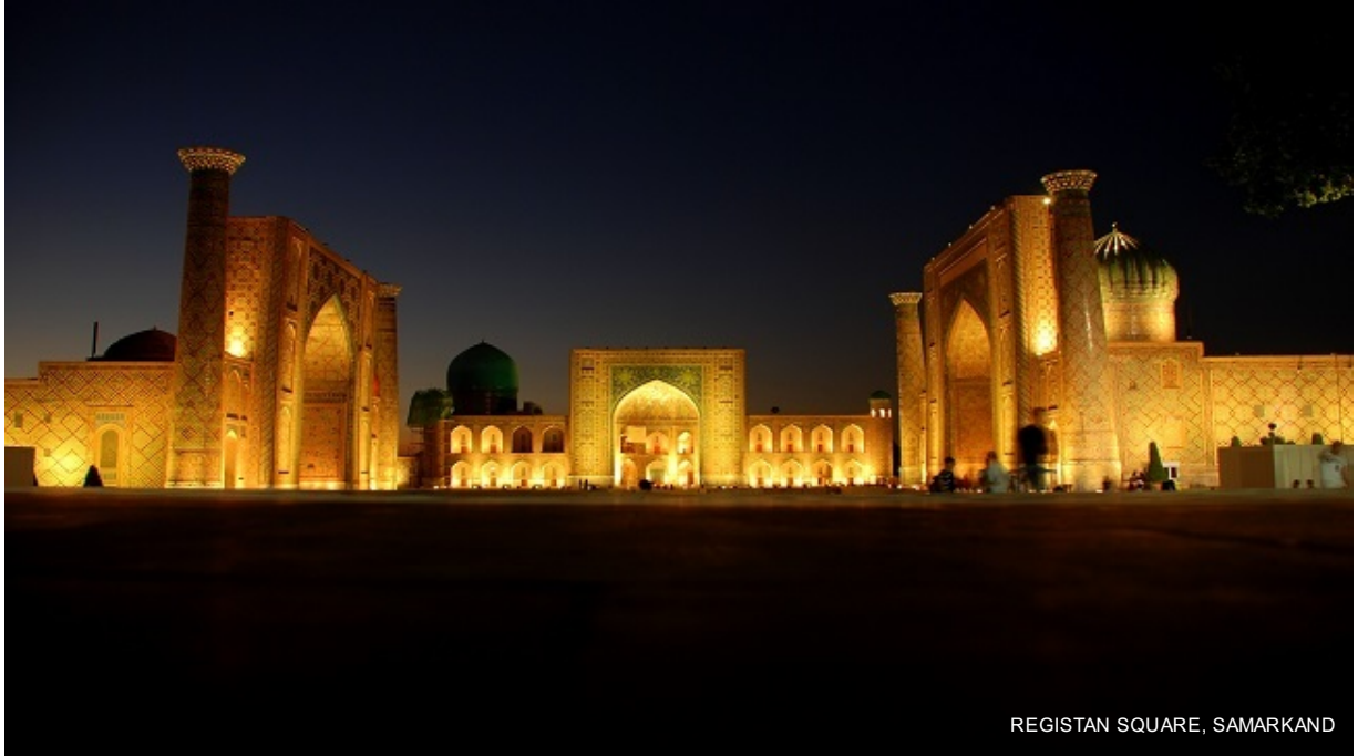
REGISTAN SQUARE, SAMARKAND