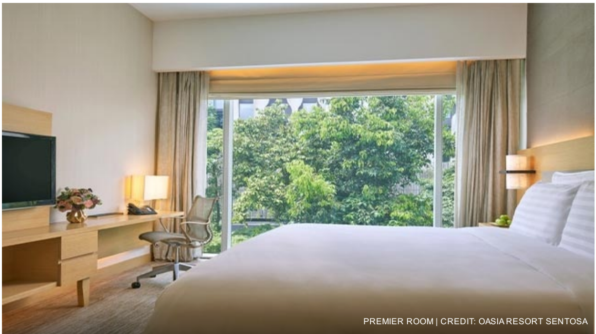
PREMIER ROOM