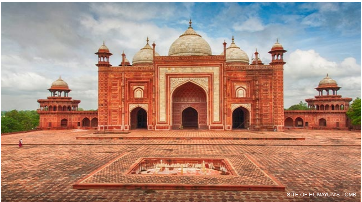
SITE OF HUMAYUN'S TOMB