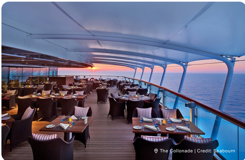
The Collonade