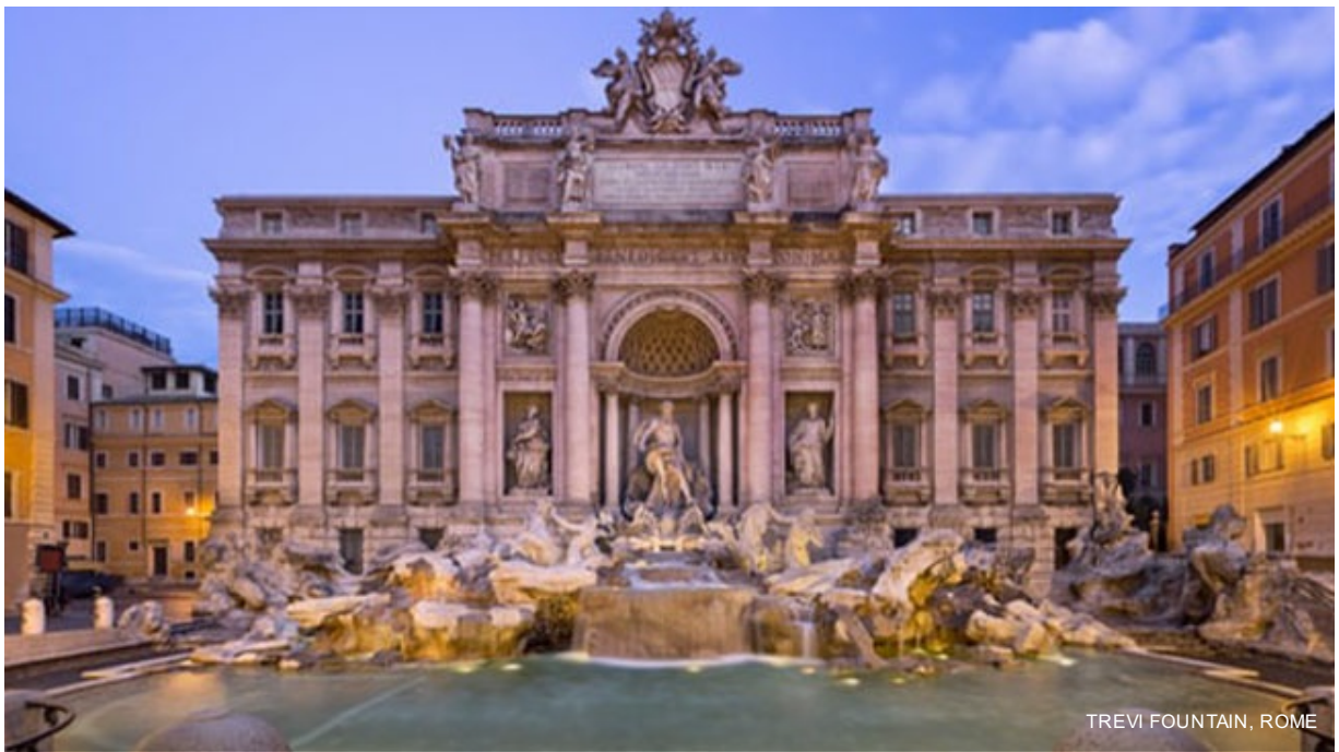
TREVI FOUNTAIN, ROME