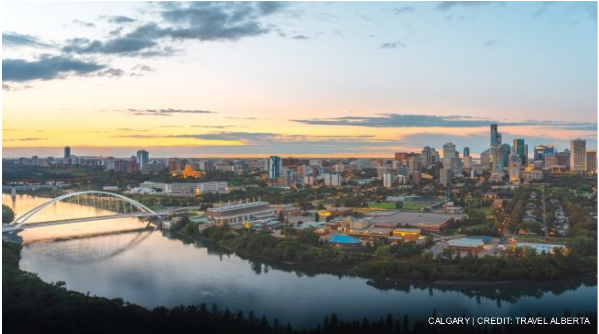
CALGARY

Overnight in Calgary at Delta Hotels by Marriott Calgary Downtown